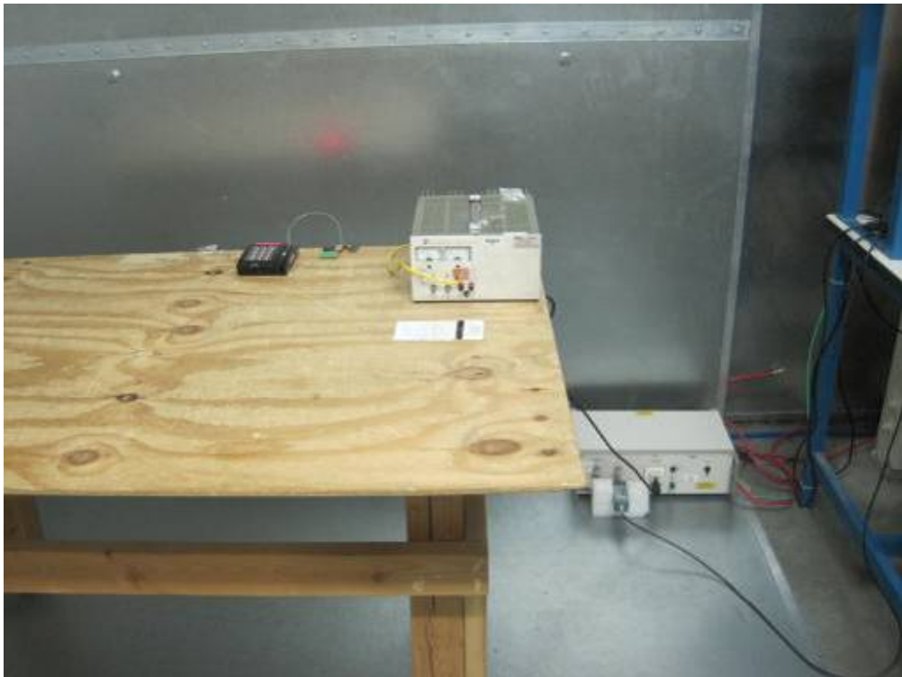
DC Line Conducted Emission Front View