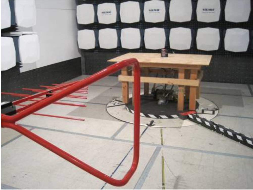
Radiated Emission View (>30MHz)