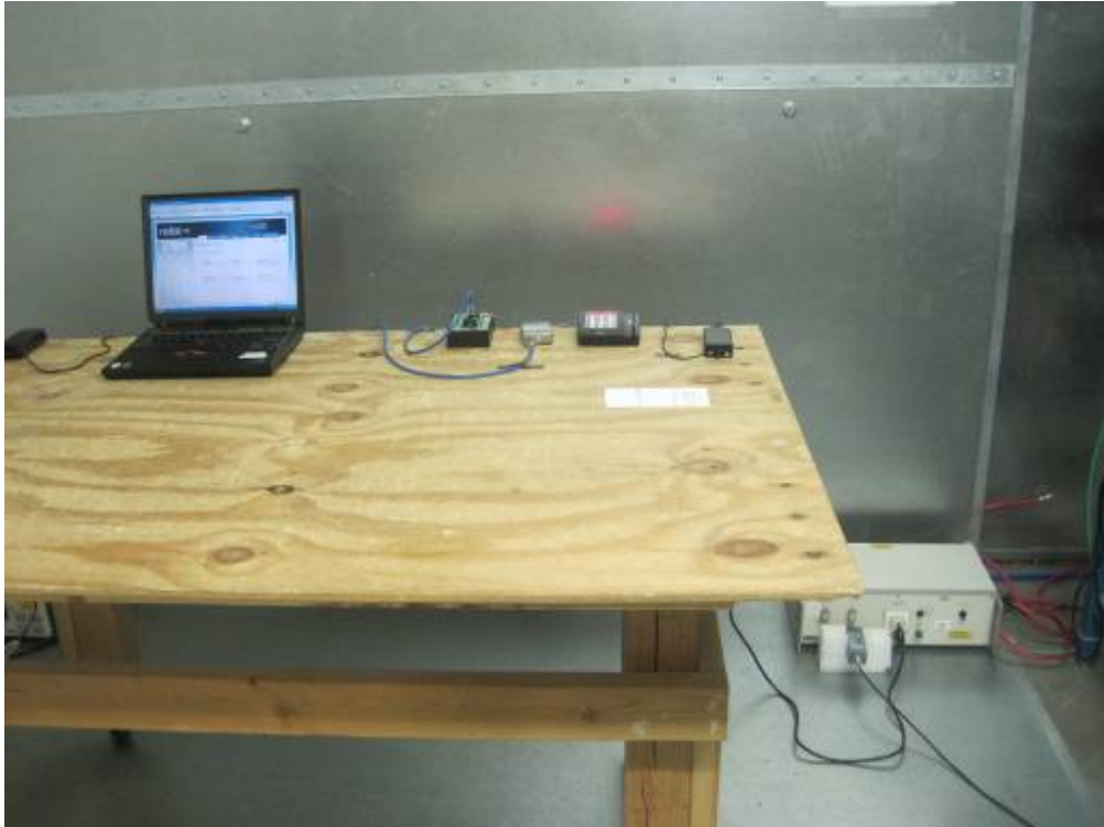
AC Line Conducted Emission Front View