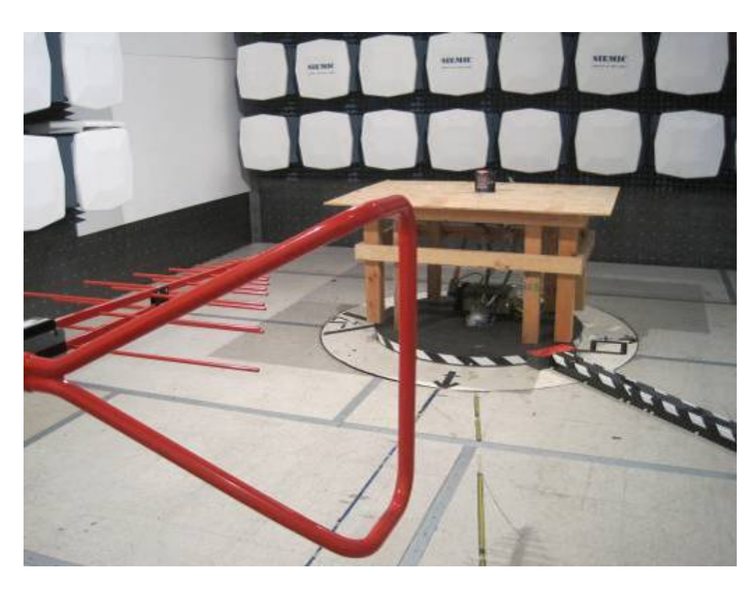
Radiated Emission View (>30MHz)