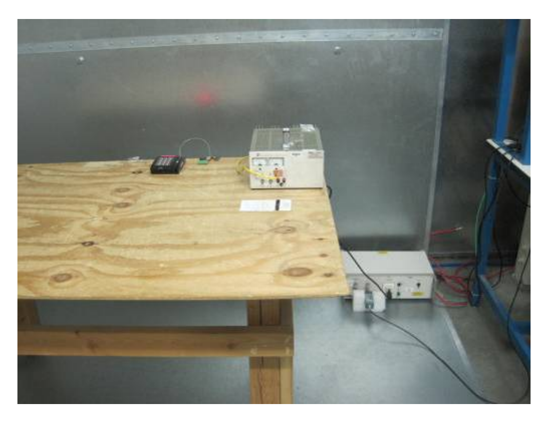
DC Line Conducted Emission Front View