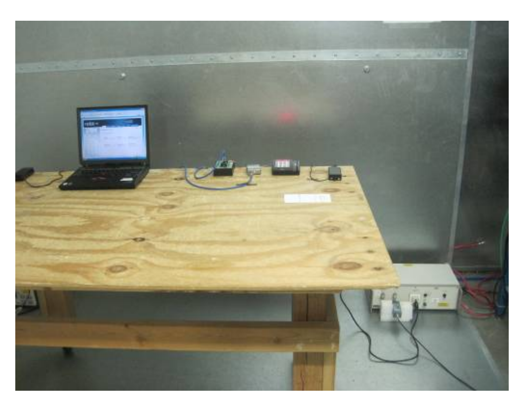
AC Line Conducted Emission Front View