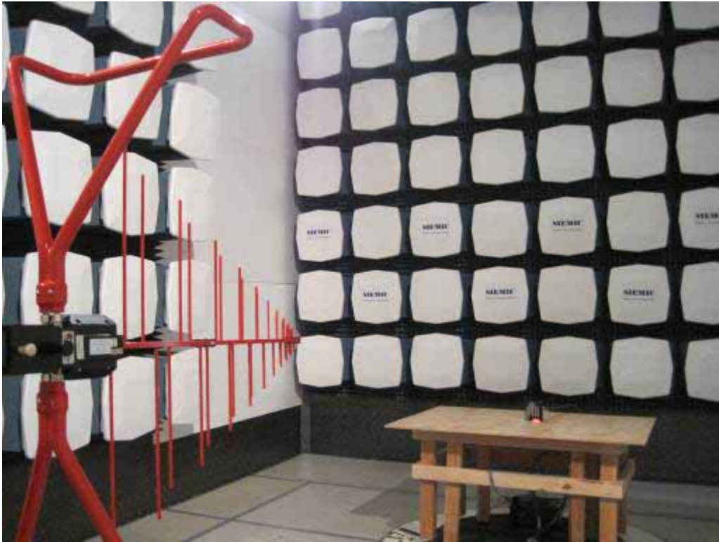
Radiated Emission View (>30MHz)