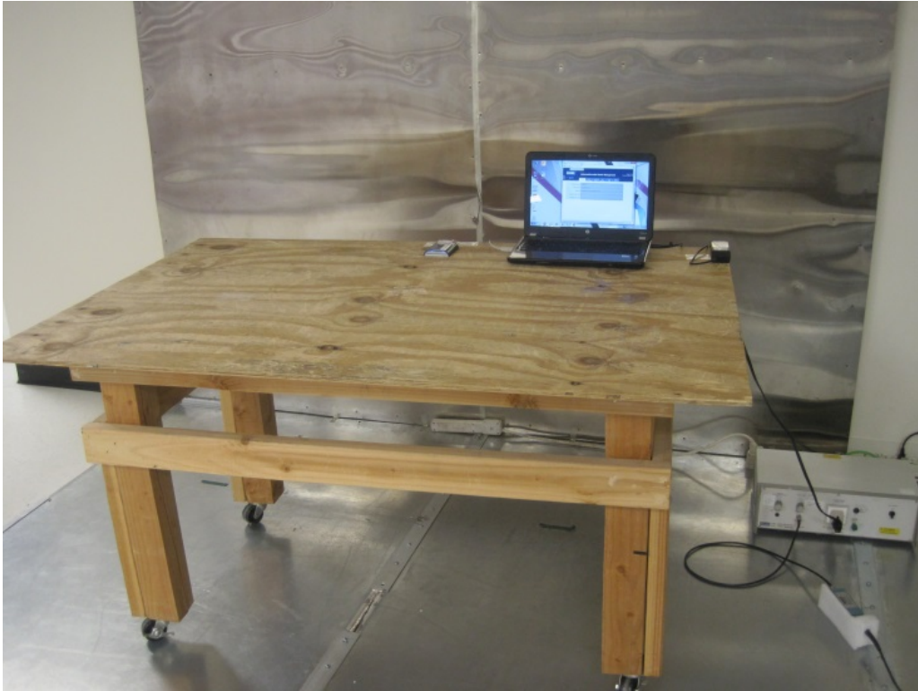
AC Line Conducted Emission – Front View