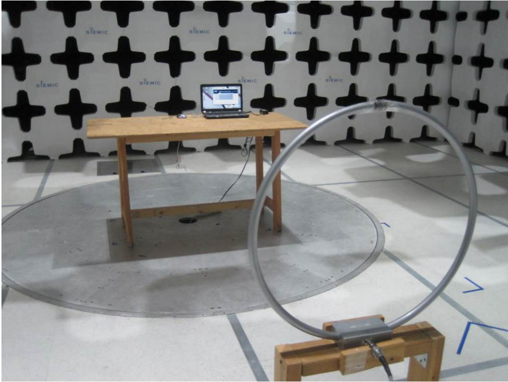
Radiated Emission (<30MHz) – Front View