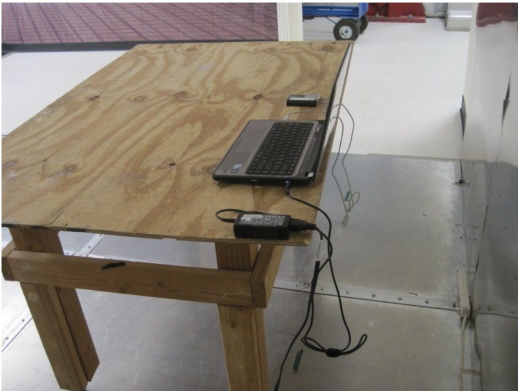
AC Line Conducted Emission – Rear View