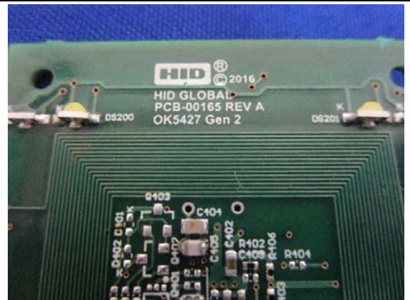
EUT Main PCB - Label View