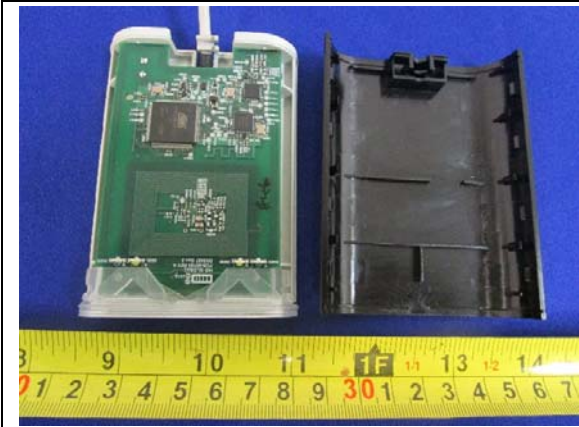
EUT Open Case View