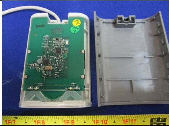
EUT Open Case View