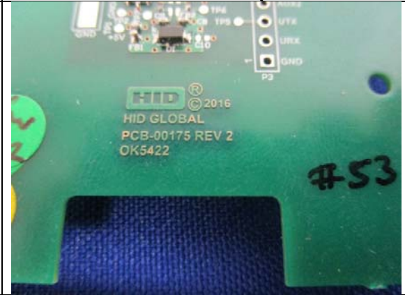
EUT Main PCB - Label View