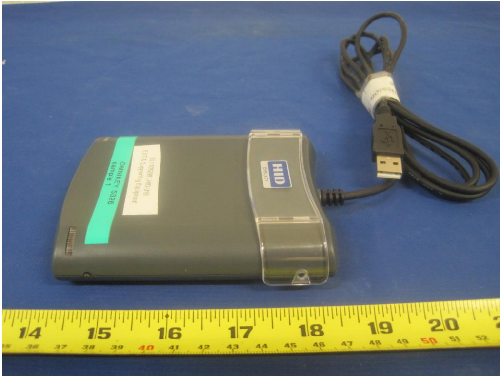
EUT Left View