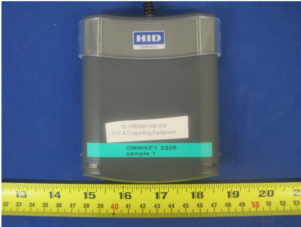
EUT Top View