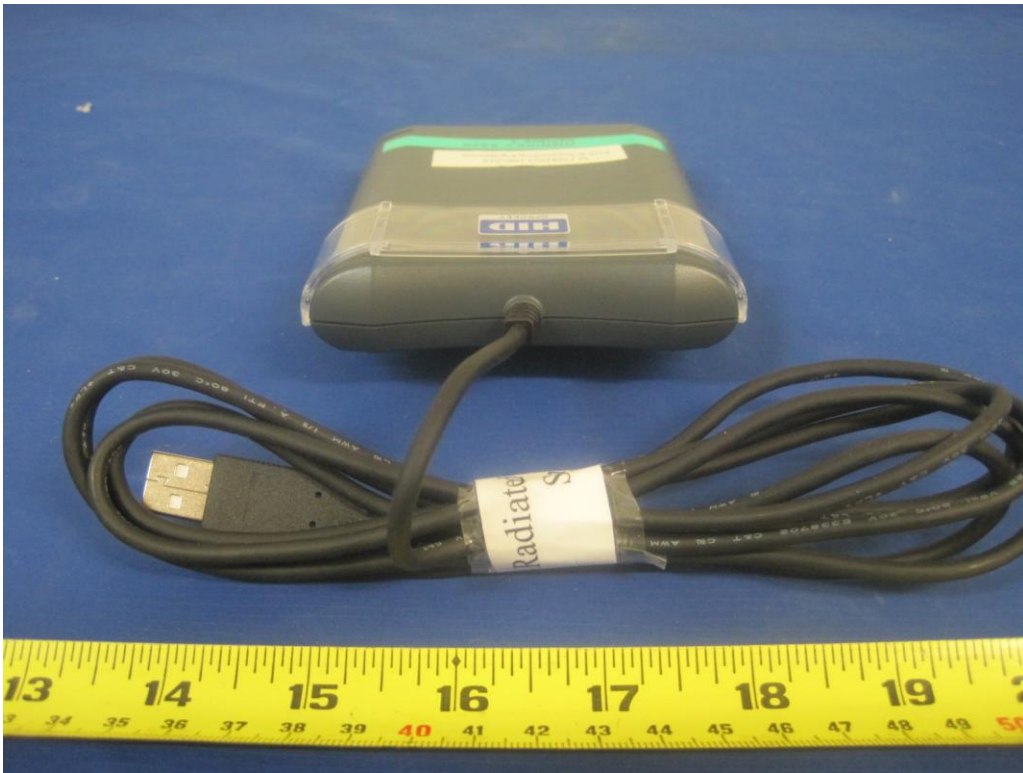
EUT Back View