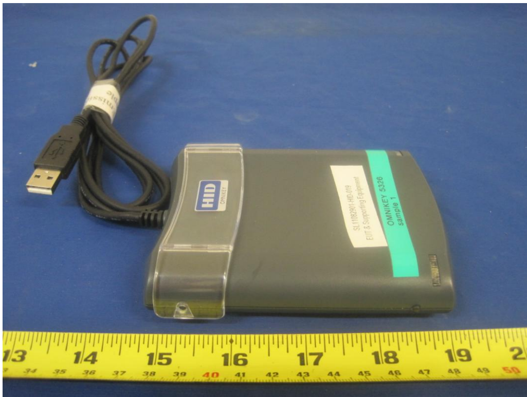
EUT Right View