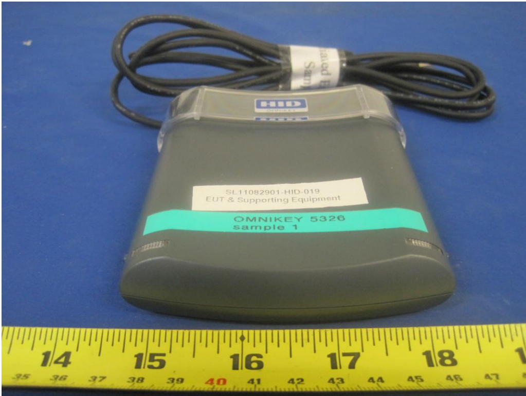
EUT Front View