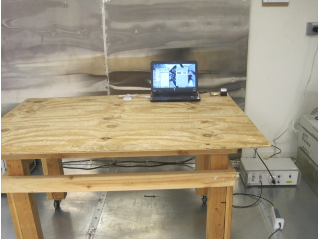
AC Line Conducted Emission – Front View