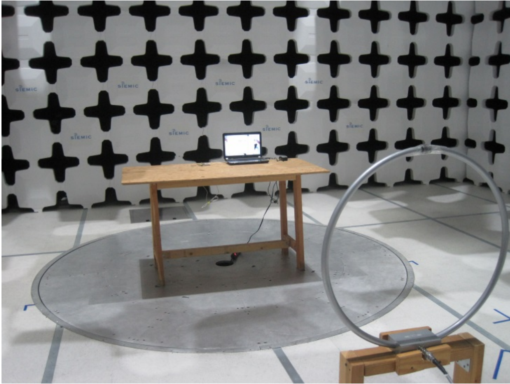
Radiated Emission (<30MHz) – Front View