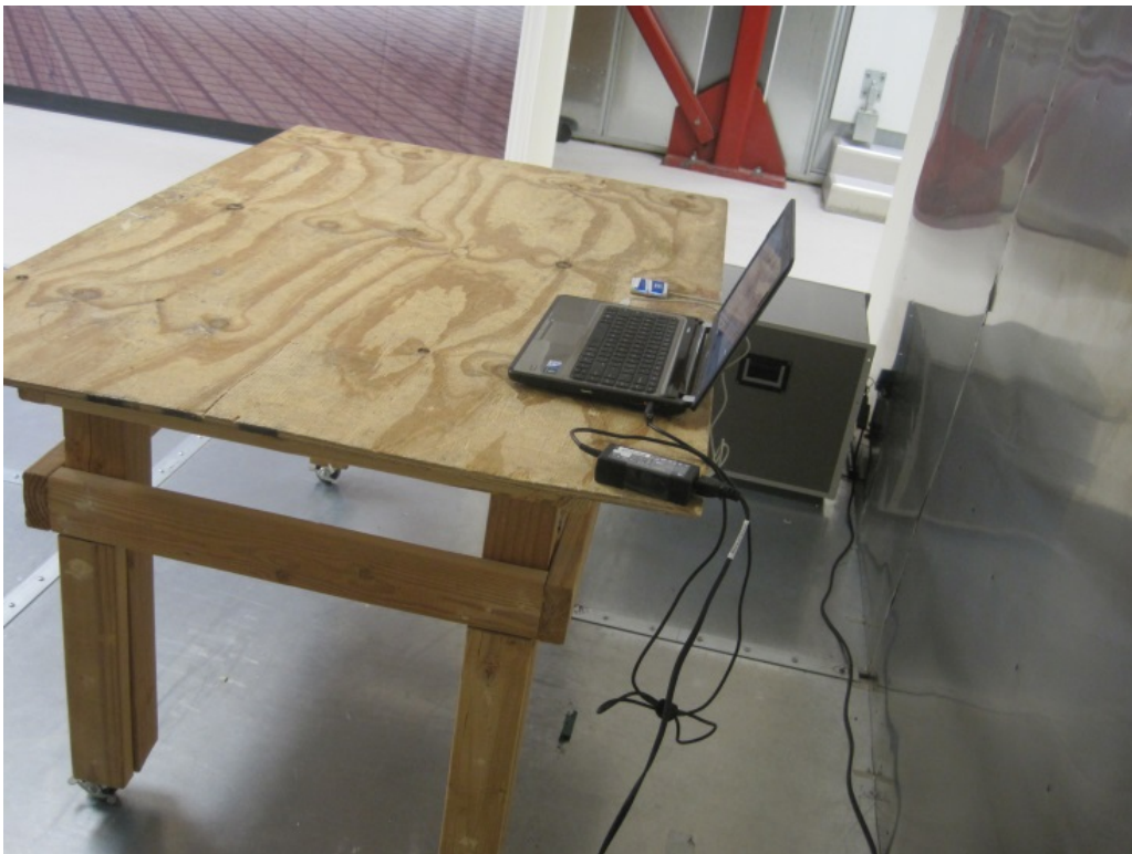
AC Line Conducted Emission – Rear View