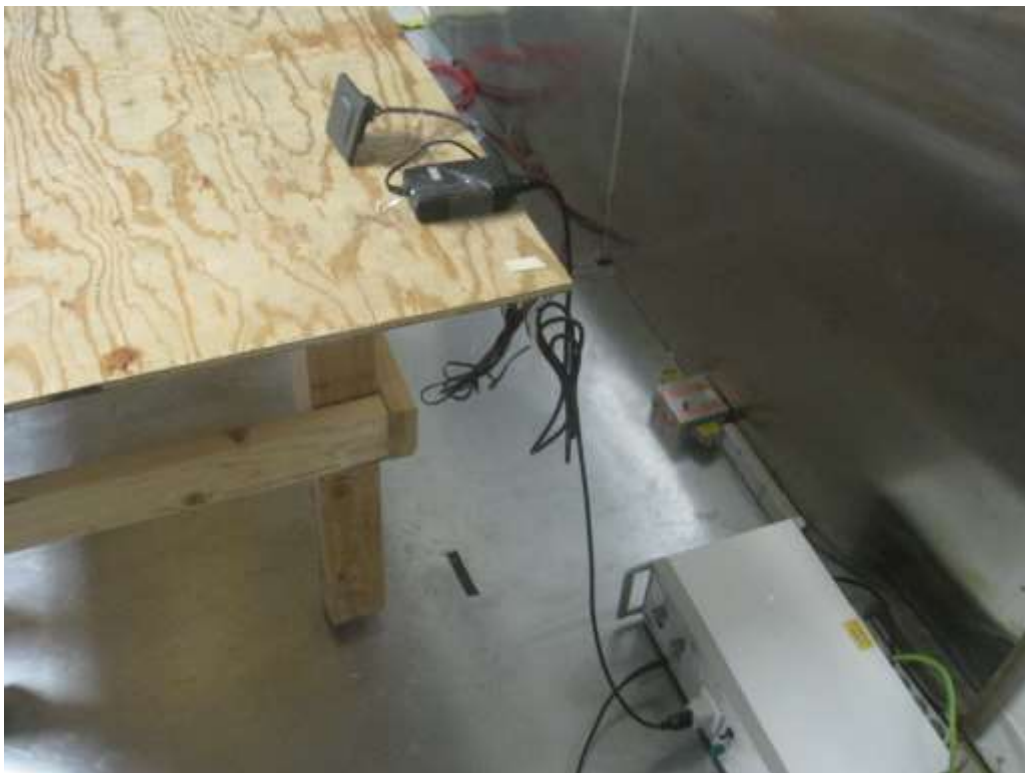
AC Line Conducted Emission - Front View