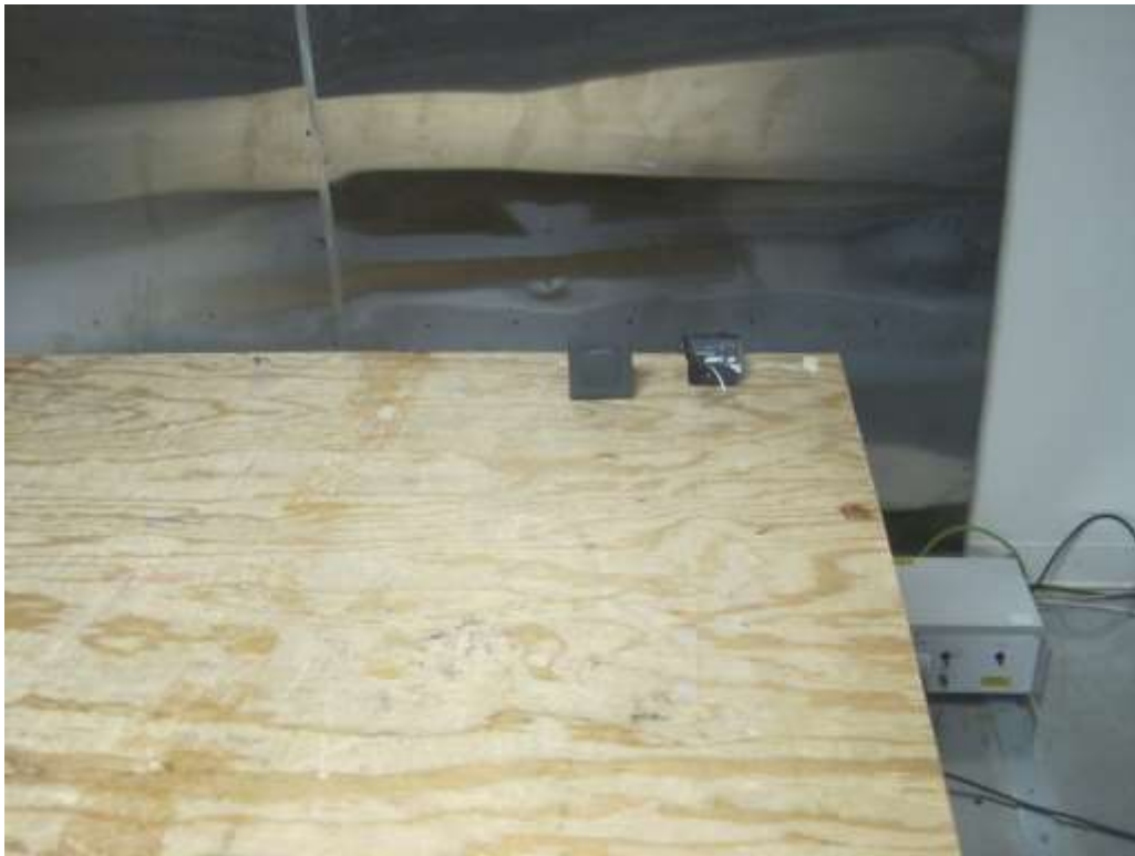
AC Line Conducted Emission - Front View