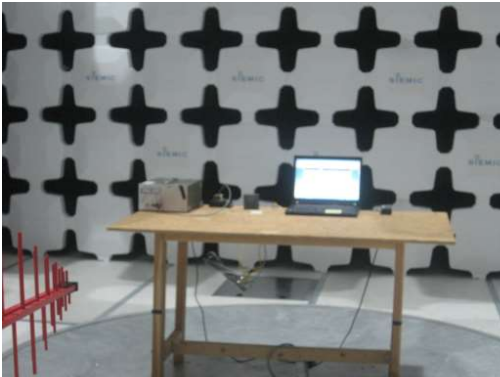
Radiated Emission (>30MHz) – Front View