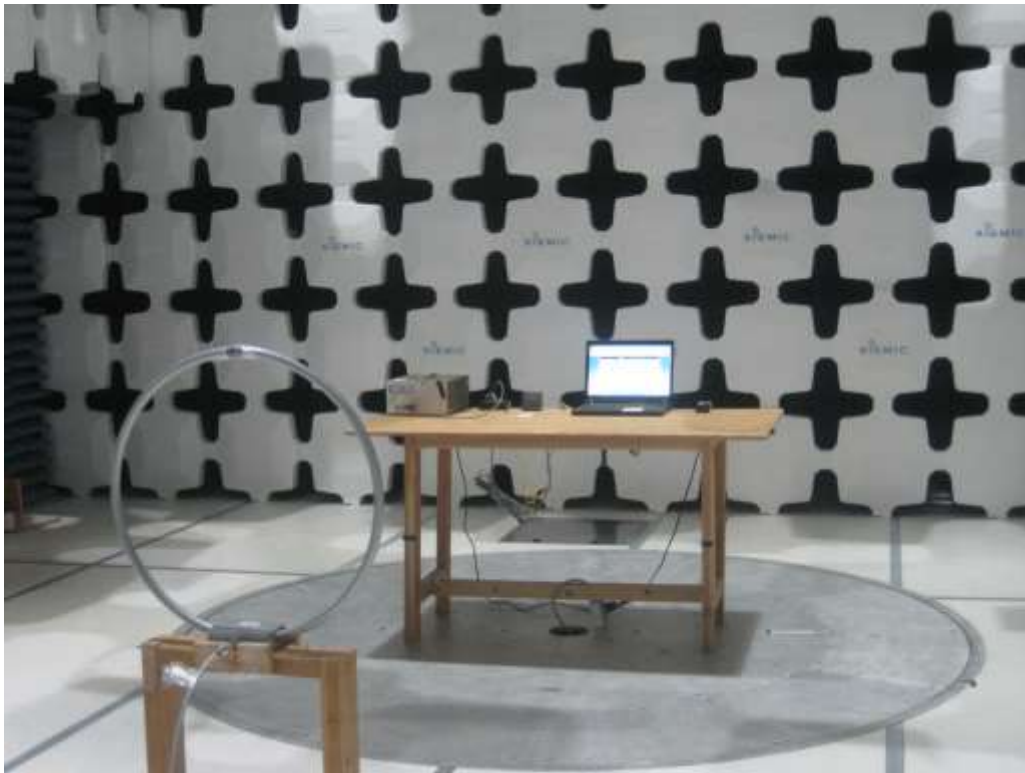
Radiated Emission (<30MHz) – Front View