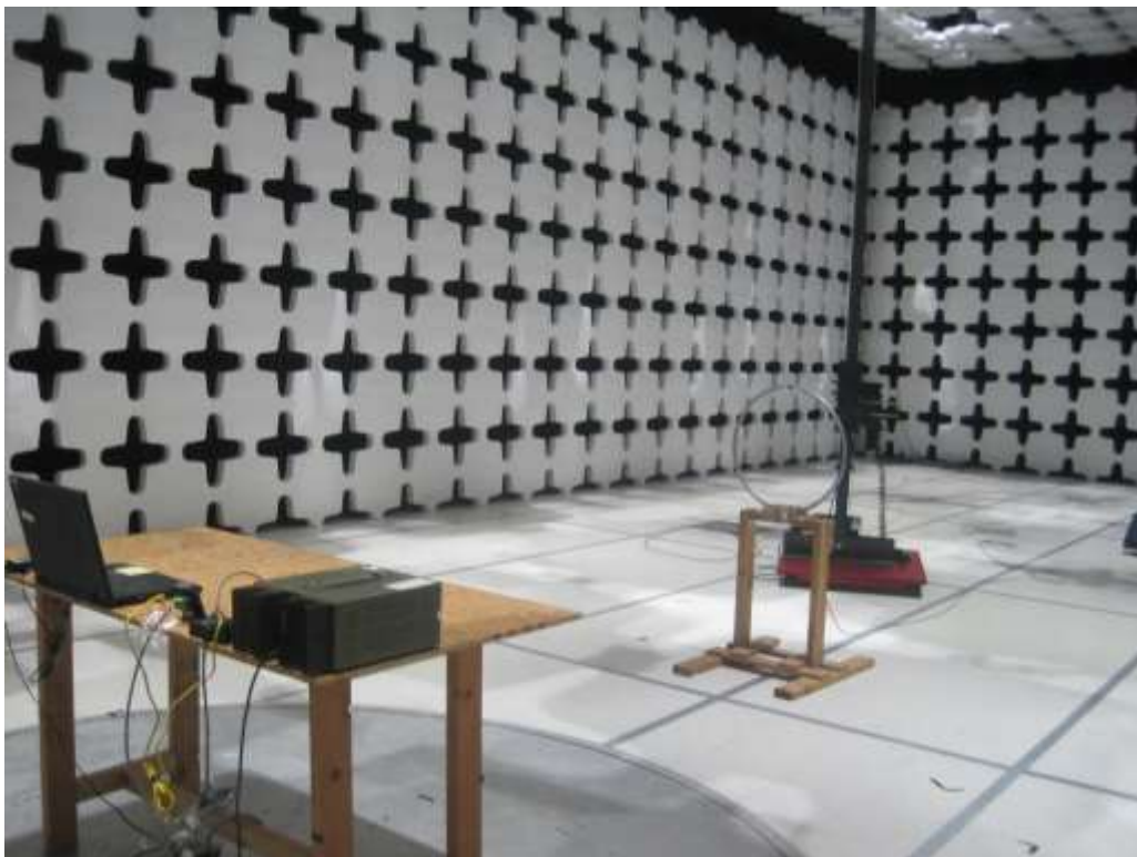
Radiated Emission (<30MHz) – Rear View