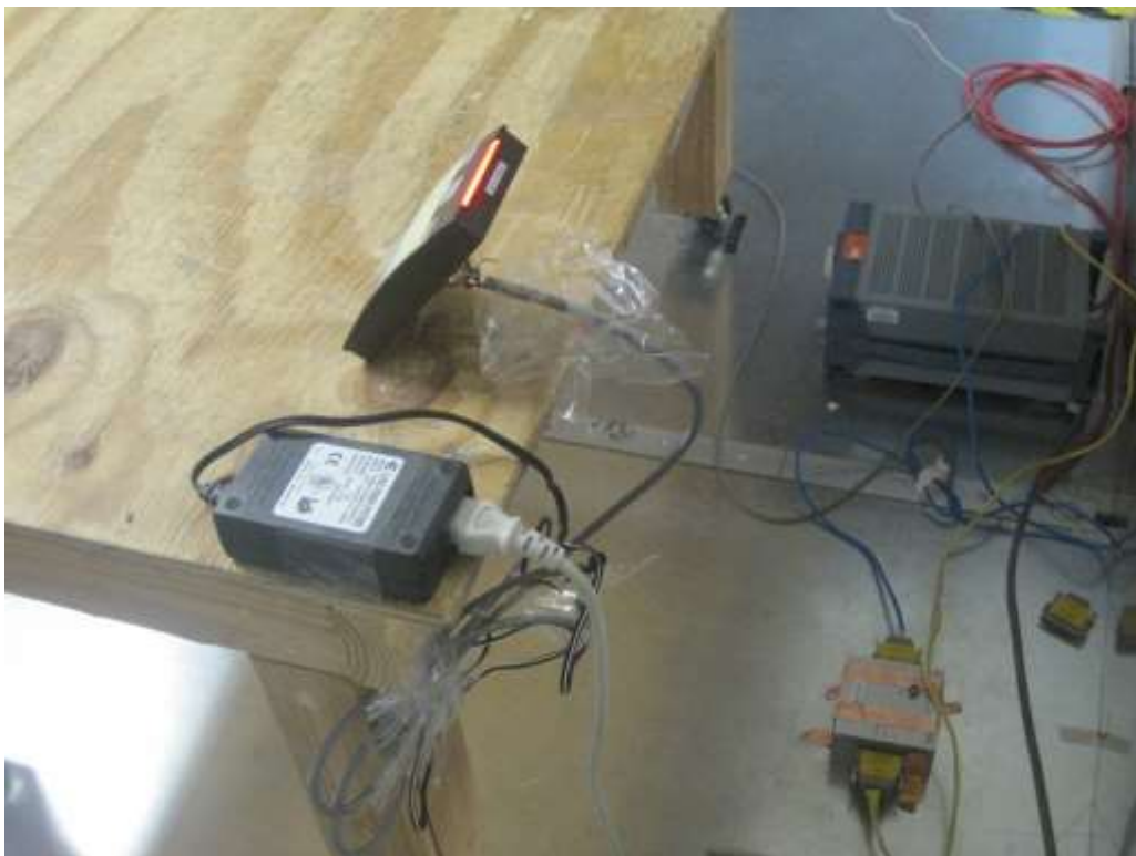
AC Line Conducted Emission - Front View