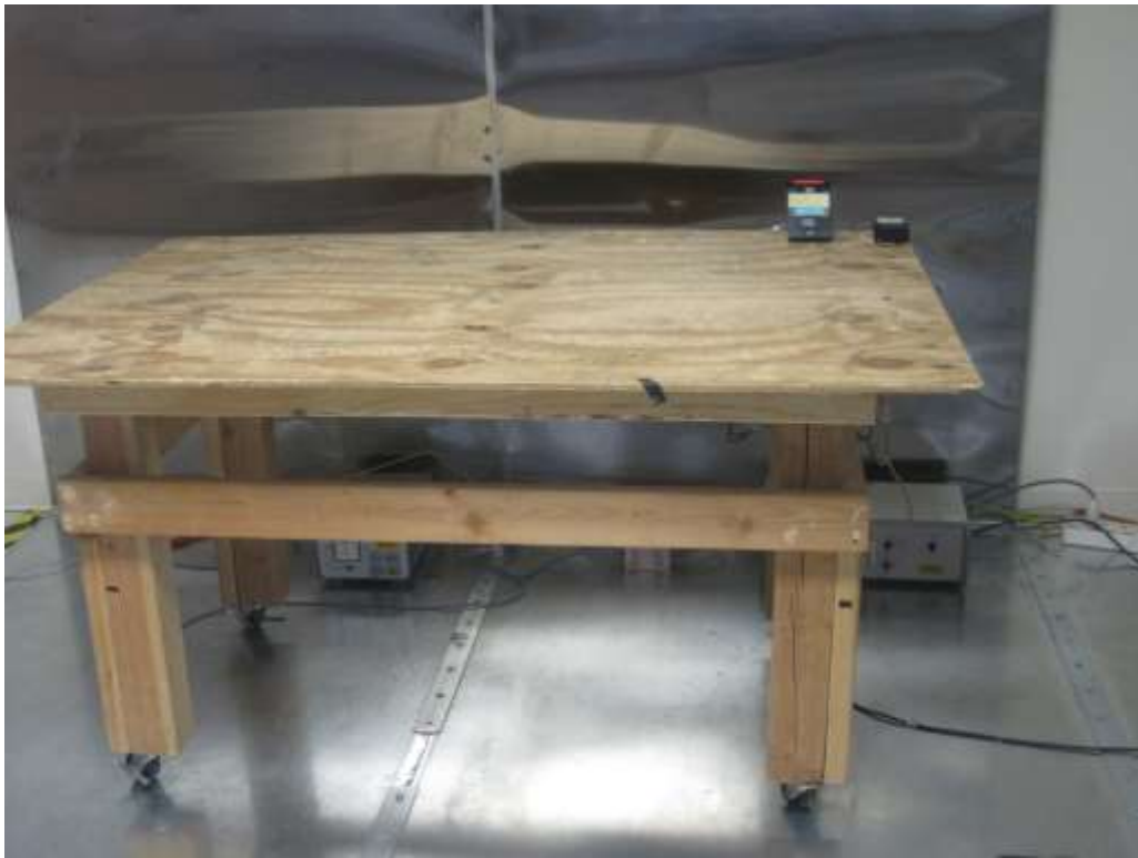
AC Line Conducted Emission - Front View