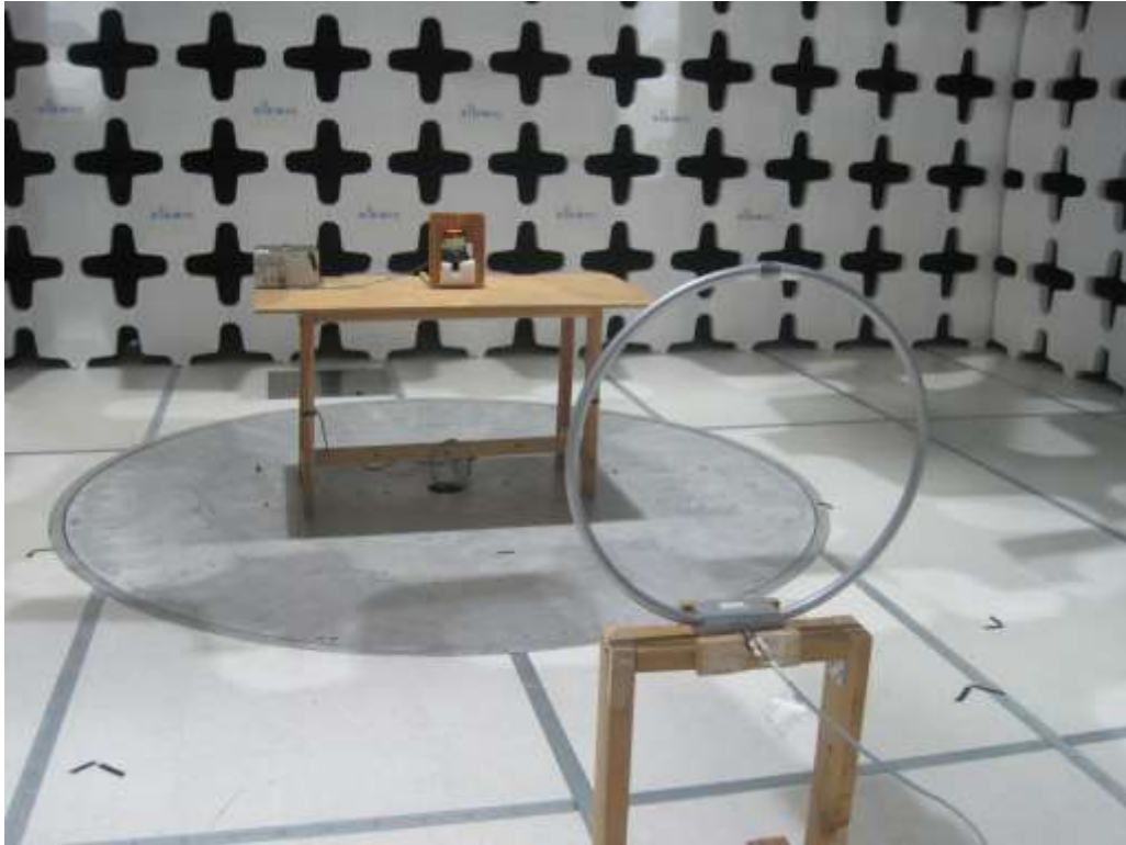
Radiated Emission (<30MHz) – Front View