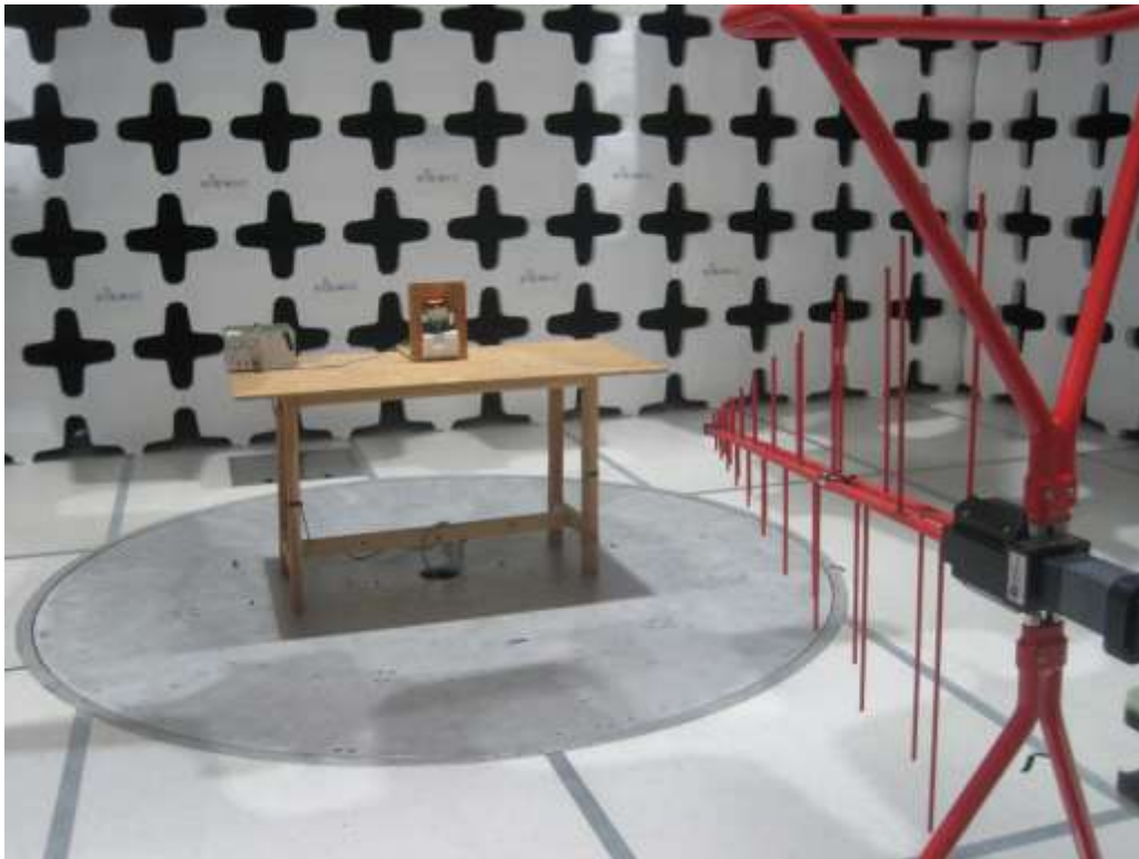
Radiated Emission (>30MHz) – Front View