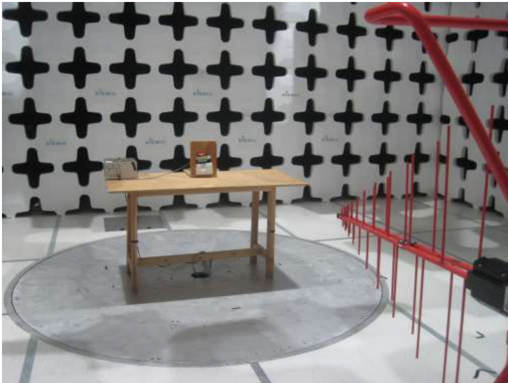
Radiated Emission (>30MHz) – Front View