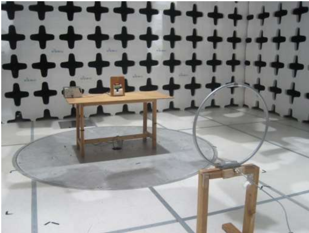
Radiated Emission (<30MHz) – Front View