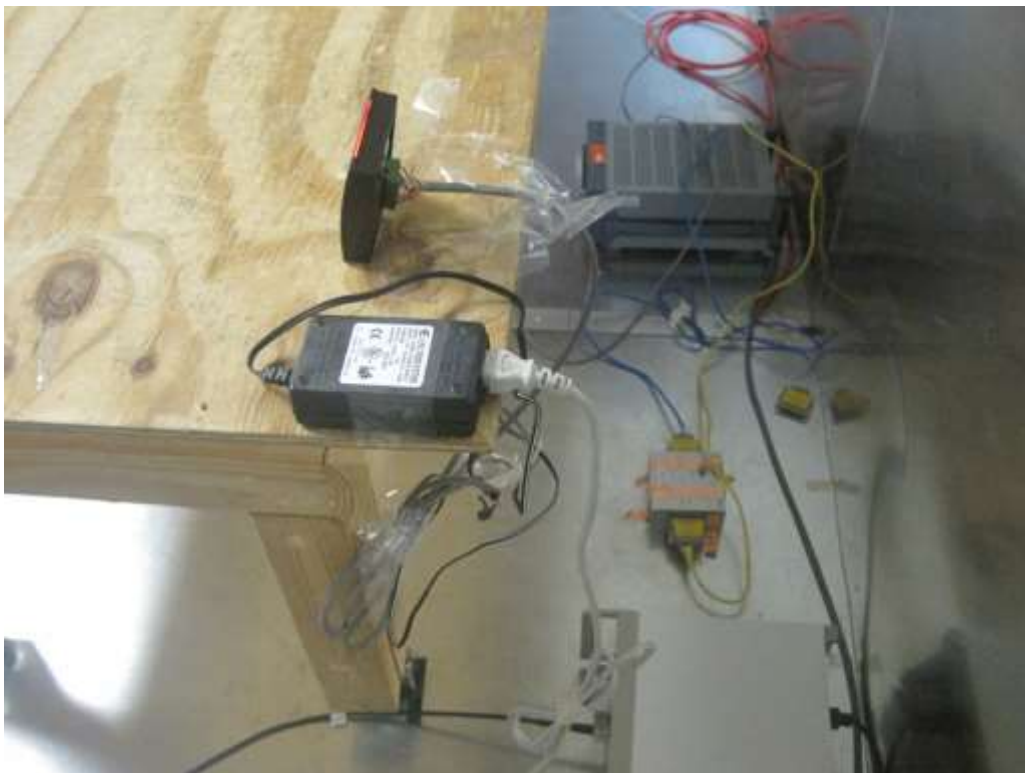
AC Line Conducted Emission - Front View