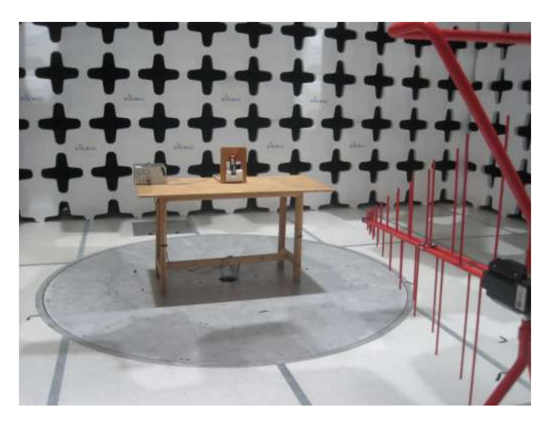
Radiated Emission (>30MHz) – Front View