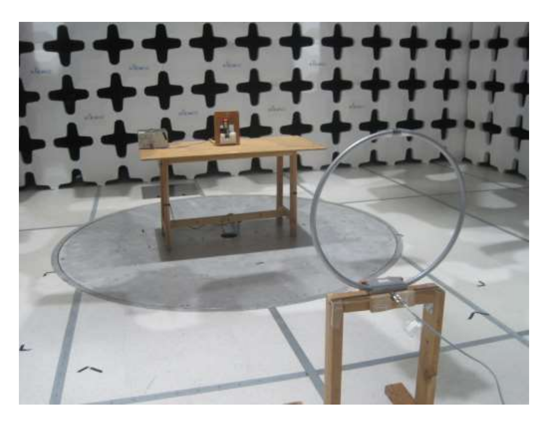
Radiated Emission (<30MHz) – Front View