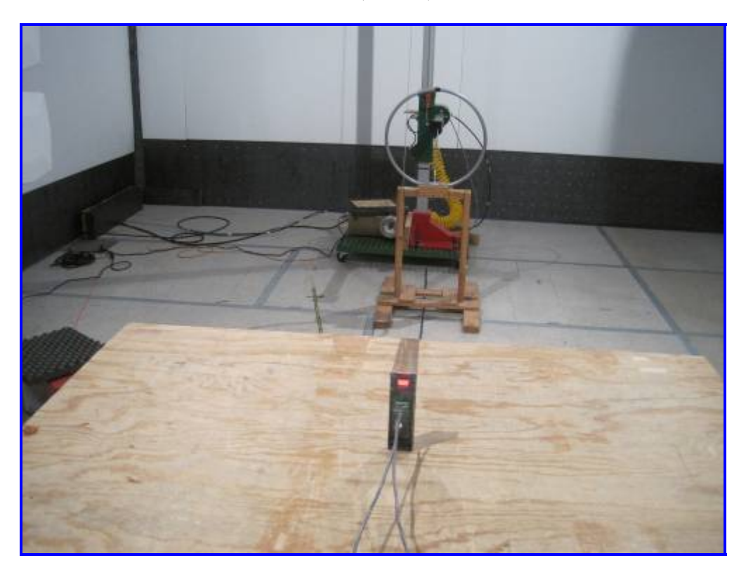
Radiated Emission (<30MHz) – Rear View