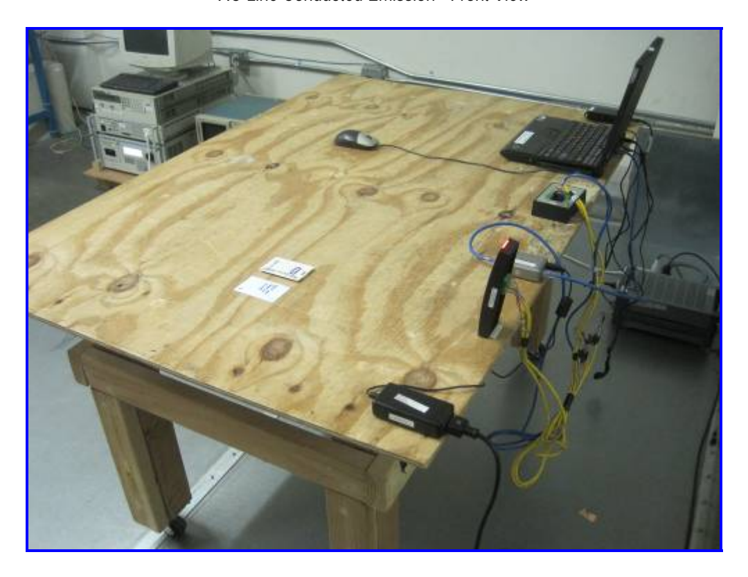
AC Line Conducted Emission - Front View