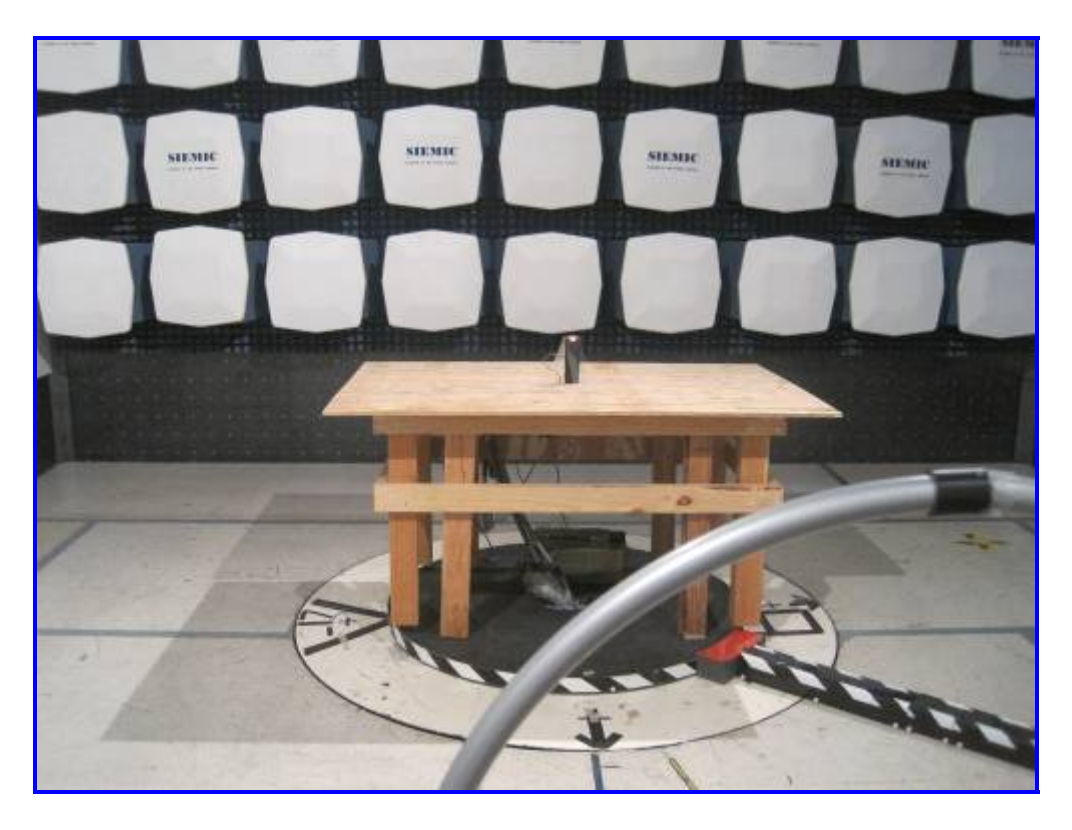
Radiated Emission (<30MHz) – Front View