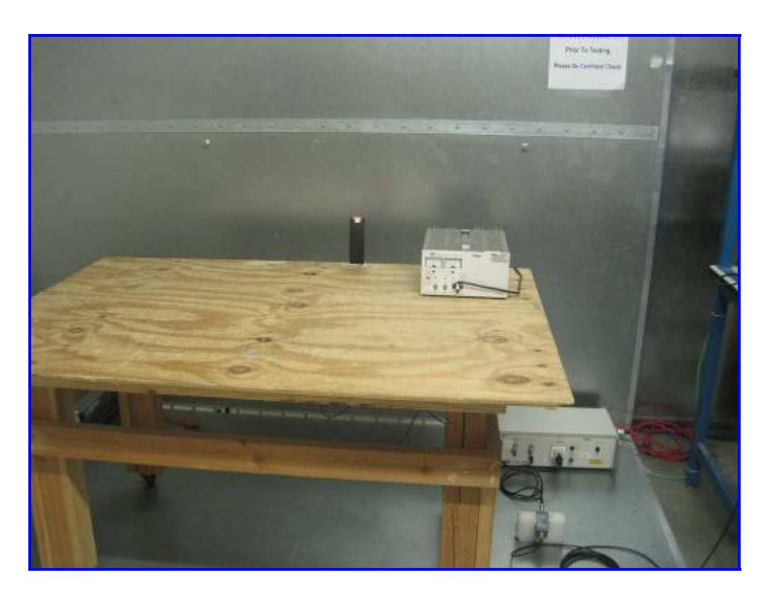
DC Line Conducted Emission - Front View