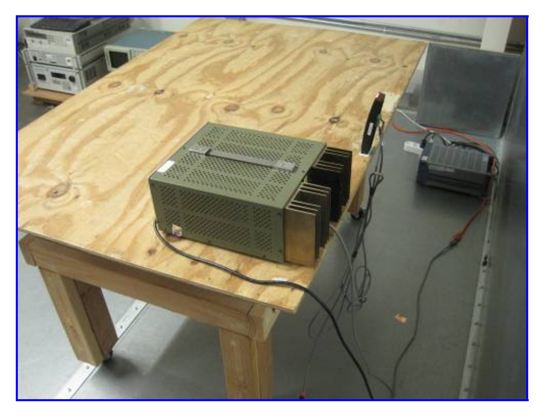
DC Line Conducted Emission - Front View