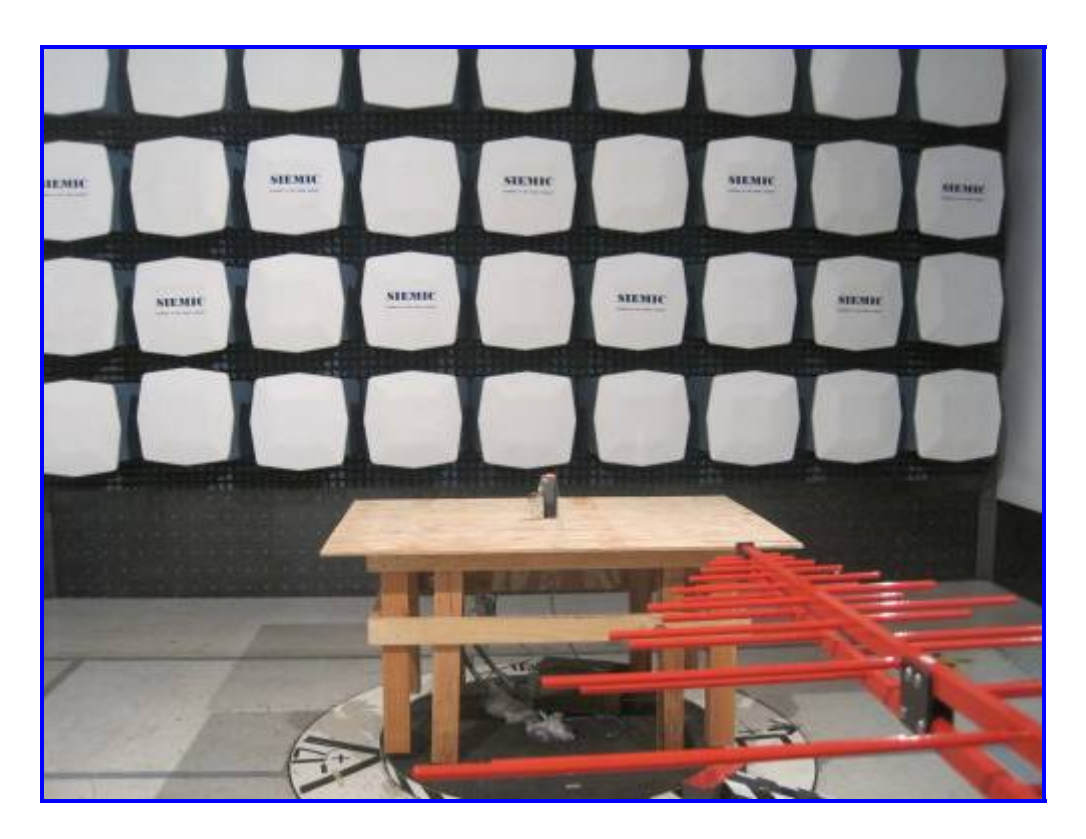
Radiated Emission (>30MHz) – Front View