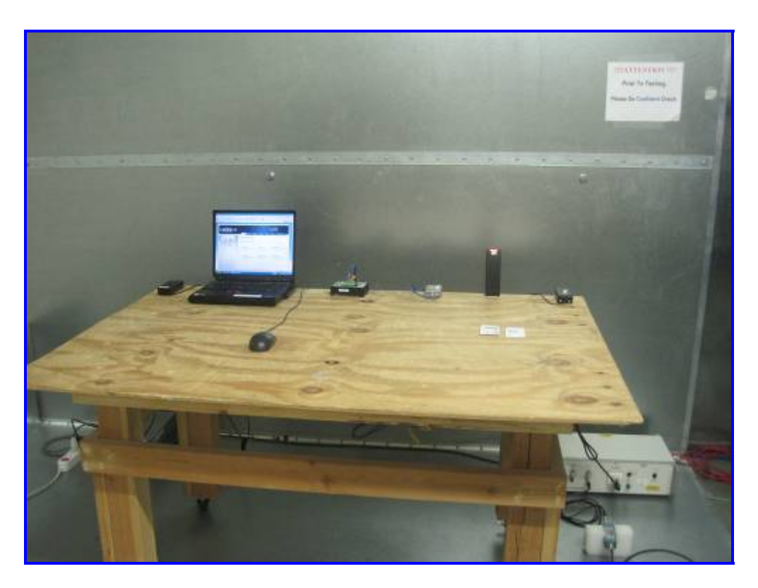
AC Line Conducted Emission - Front View