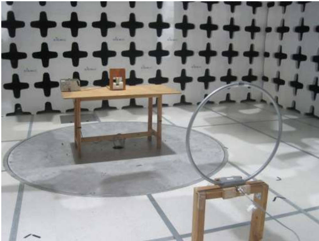
Radiated Emission (<30MHz) – Front View