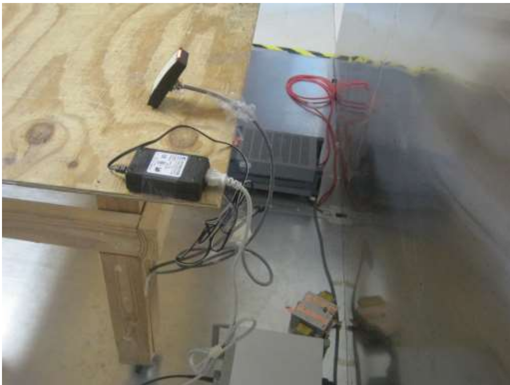
AC Line Conducted Emission - Front View