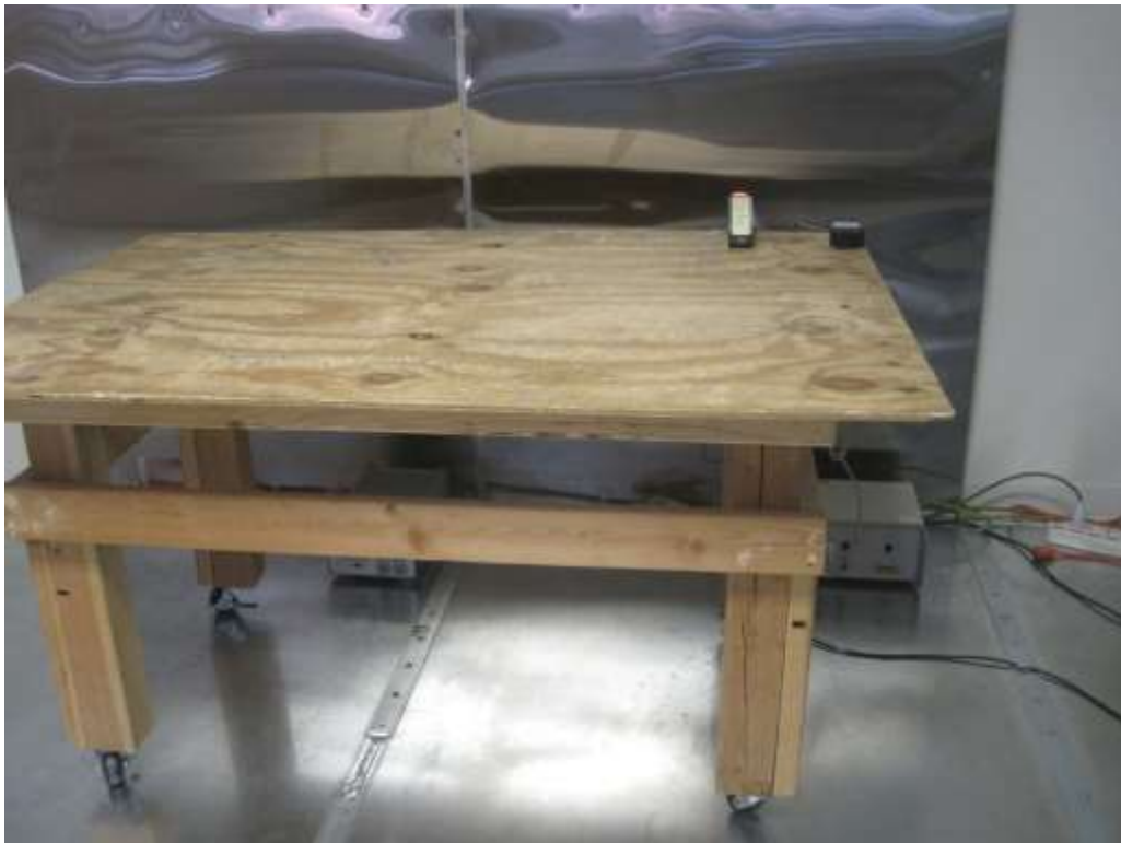
AC Line Conducted Emission - Front View