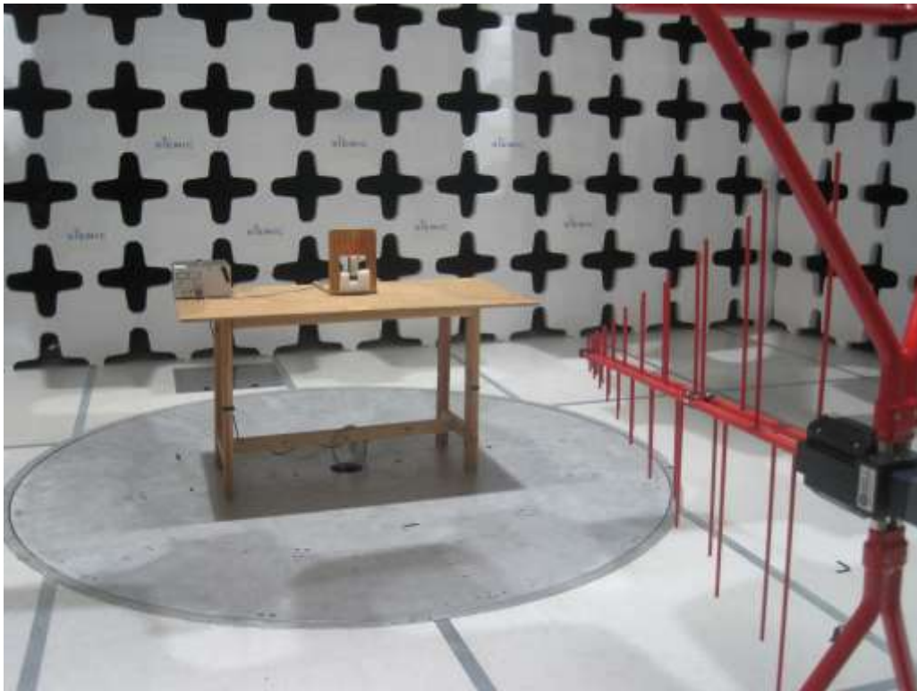
Radiated Emission (>30MHz) – Front View