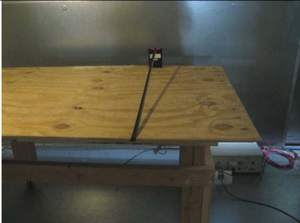
AC Line Conducted Emission Test Setup – Front View

FCC ID: JQ6-MCLASS40N and IC ID: 2236B-ICLASS Model: RP40N-6408-300