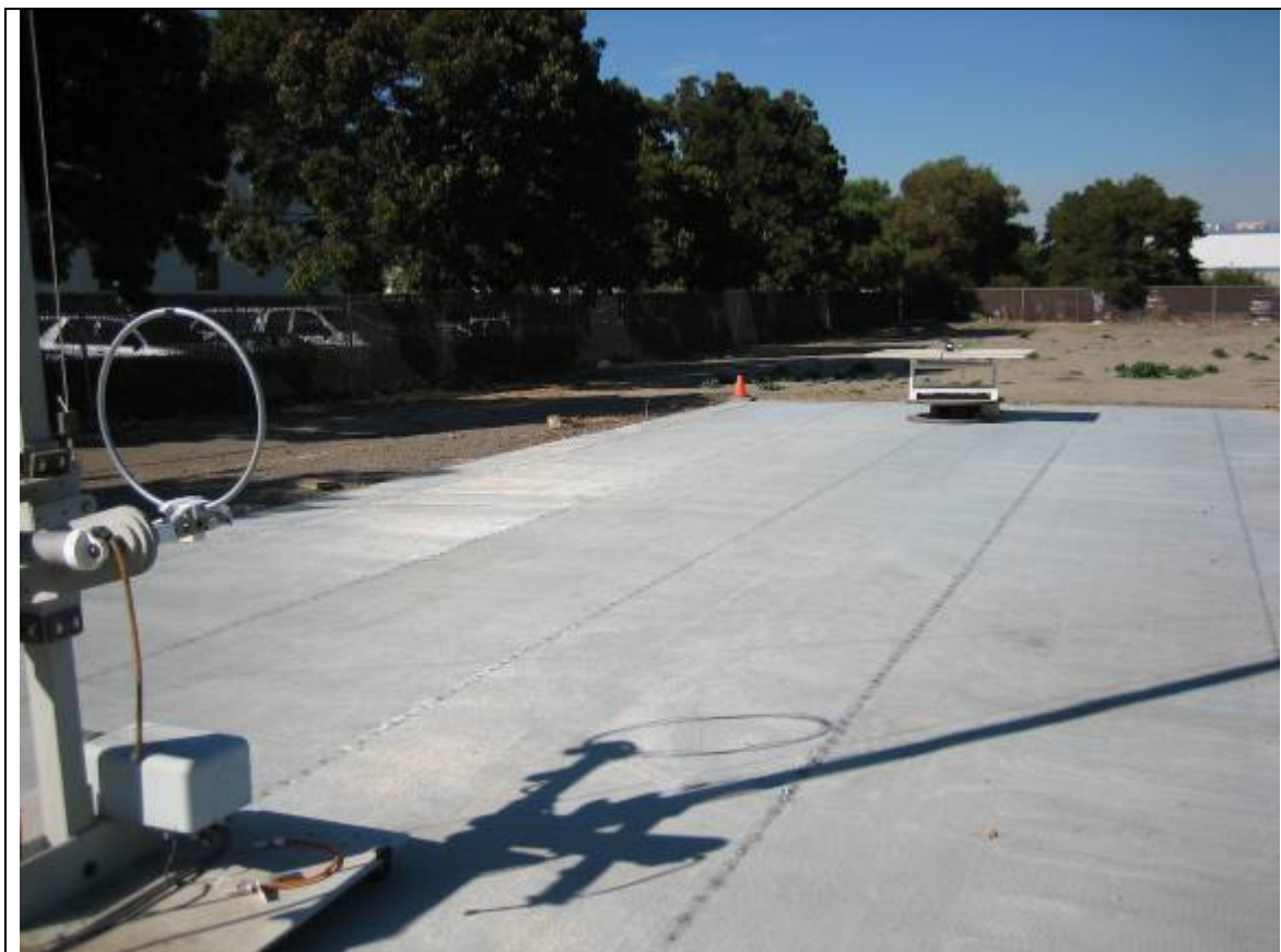
Radiated Emission Test Setup – Front View (<30MHz)