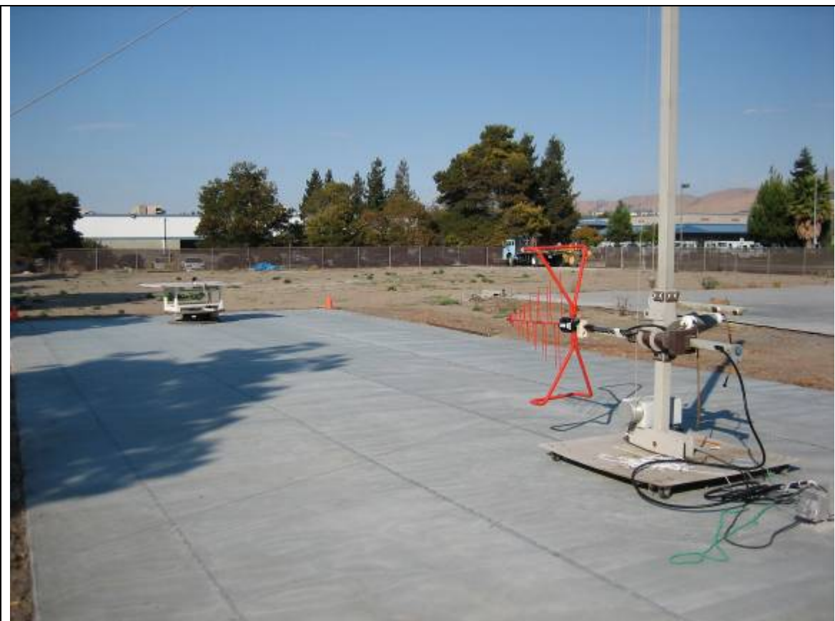
Radiated Emission Test Setup – Front View ( >30\text{MHz} )