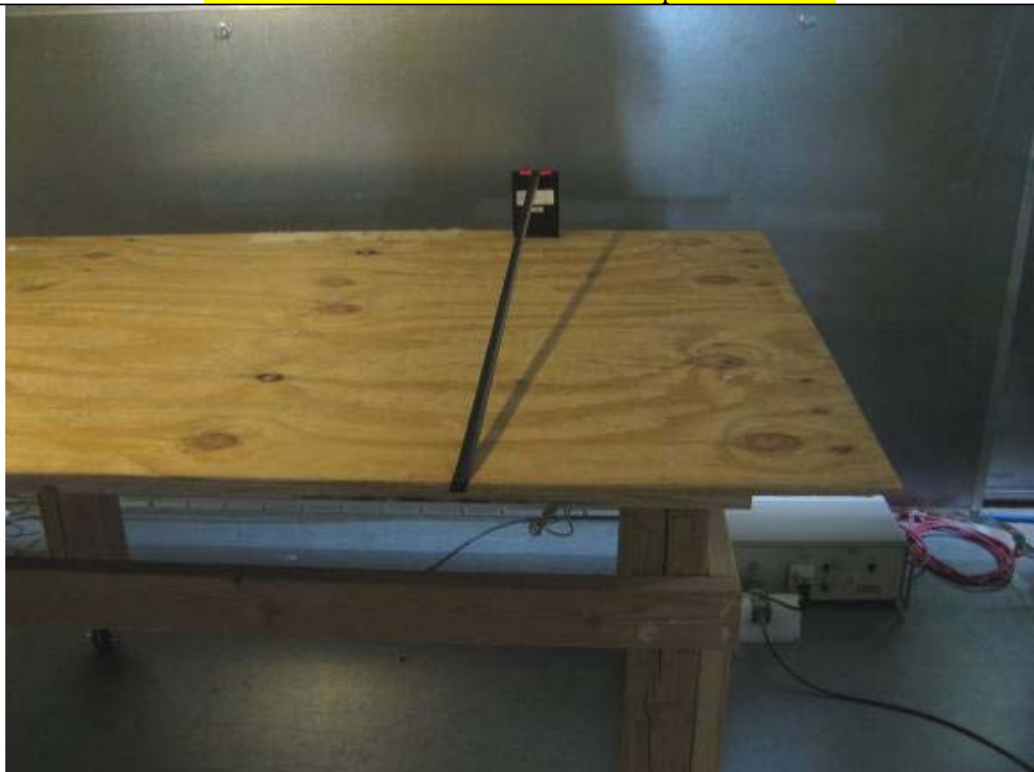
DC Line Conducted Emission Test Setup – Front View