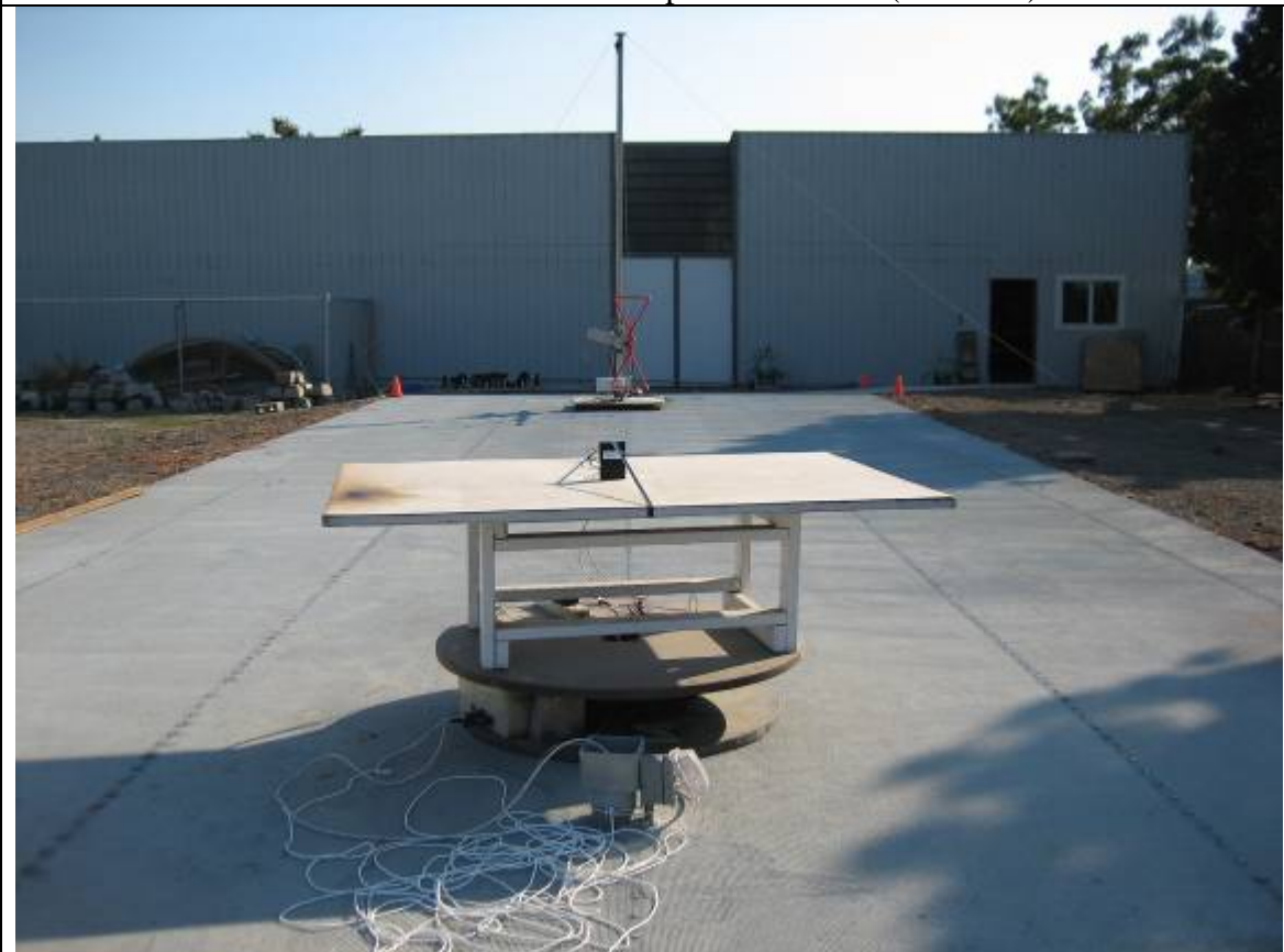
Radiated Emission Test Setup – Rear View ( >30\text{MHz} )