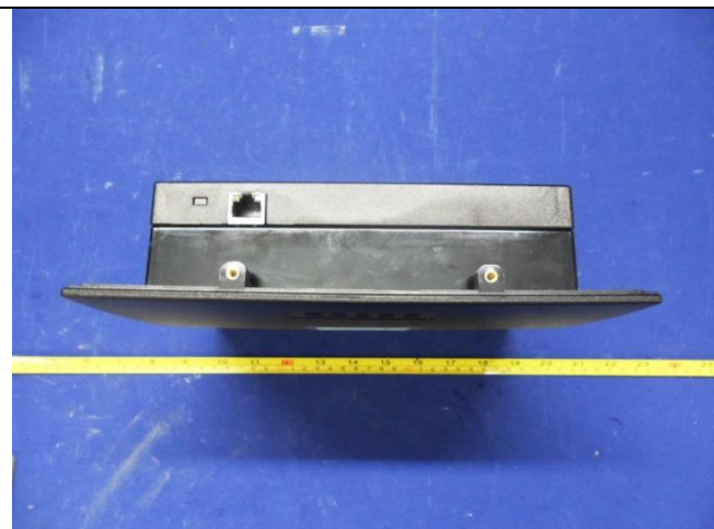
EUT – Bottom View