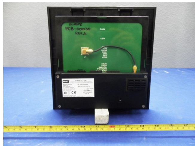
EUT – Rear View