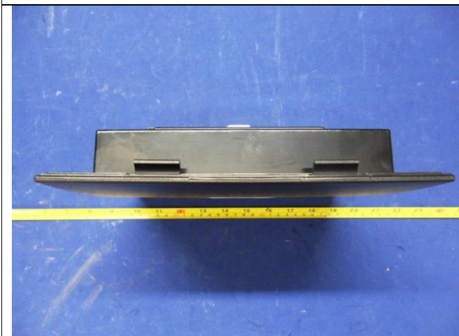
EUT – Top View