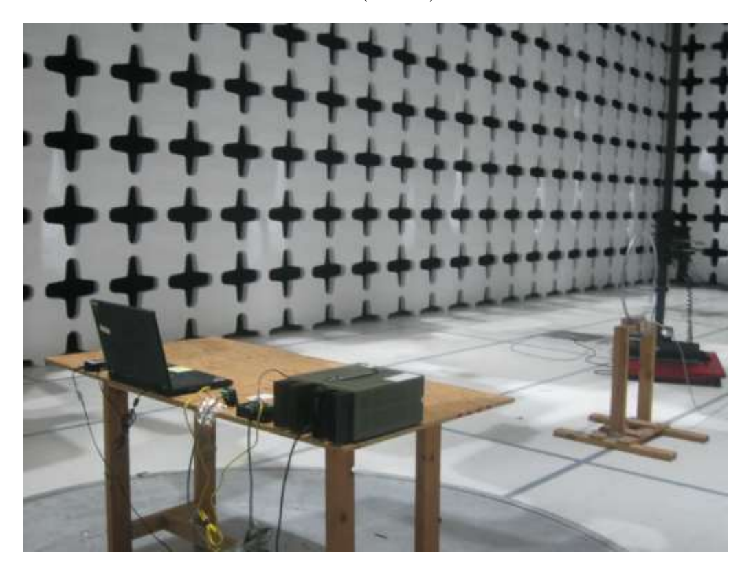
Radiated Emission (<30MHz) – Rear View