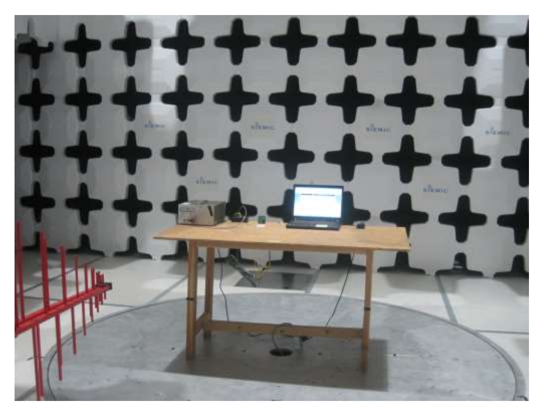
Radiated Emission (>30MHz) – Front View