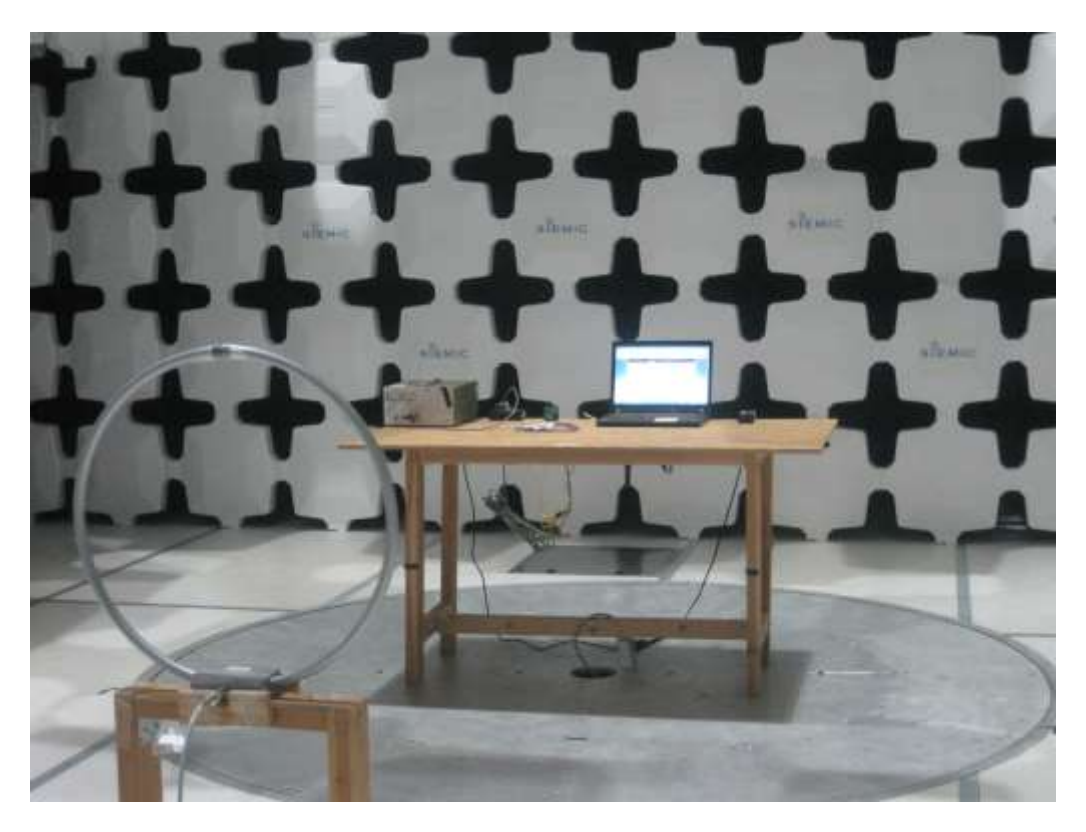
Radiated Emission (<30MHz) – Front View