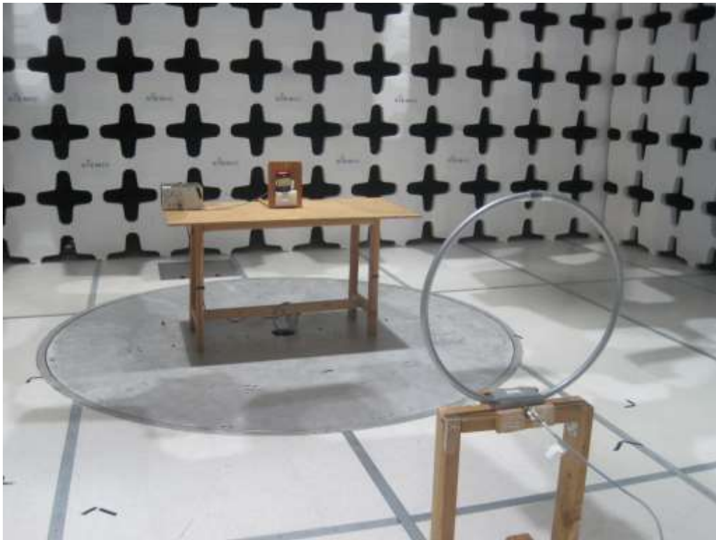
Radiated Emission (<30MHz) – Front View