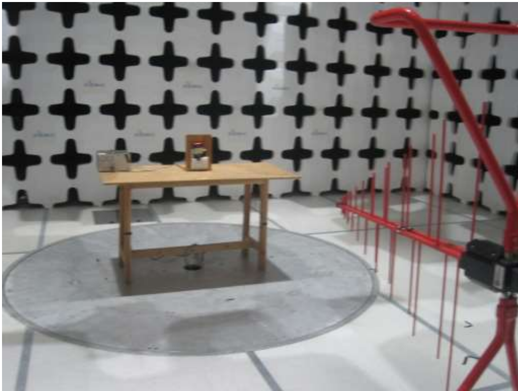
Radiated Emission (>30MHz) – Front View