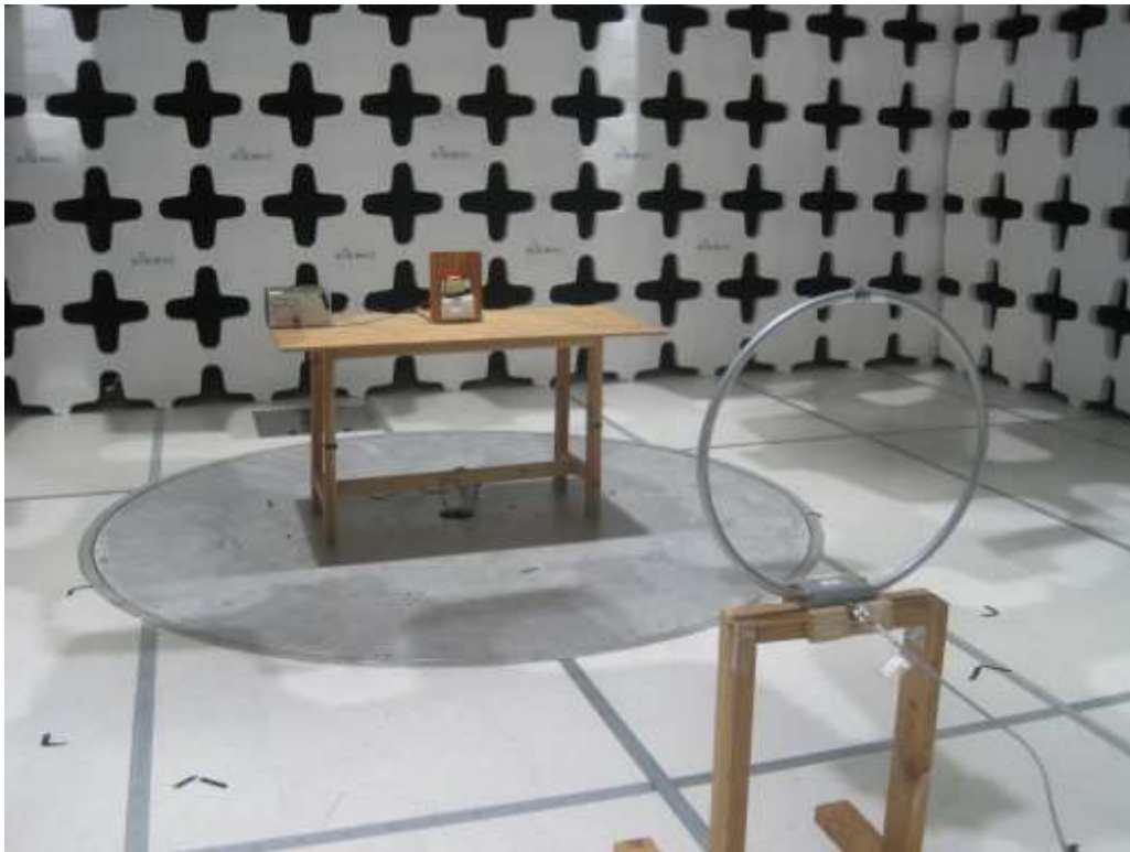
Radiated Emission (<30MHz) – Front View