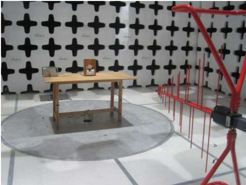
Radiated Emission (>30MHz) – Front View