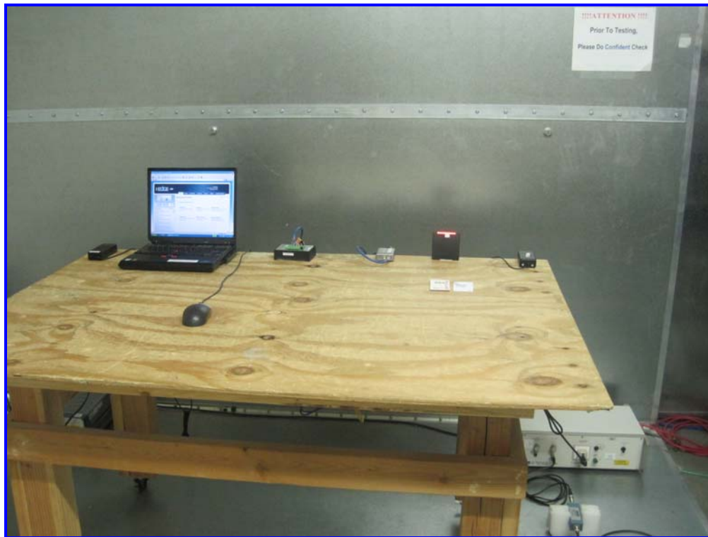
AC Line Conducted Emission - Front View