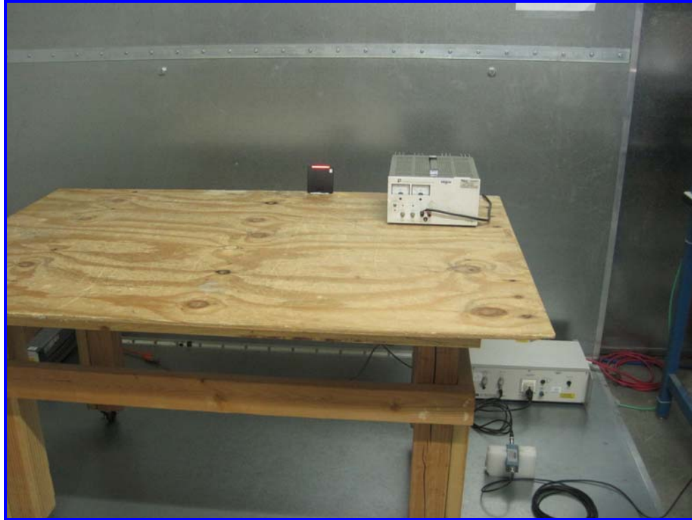
DC Line Conducted Emission - Front View