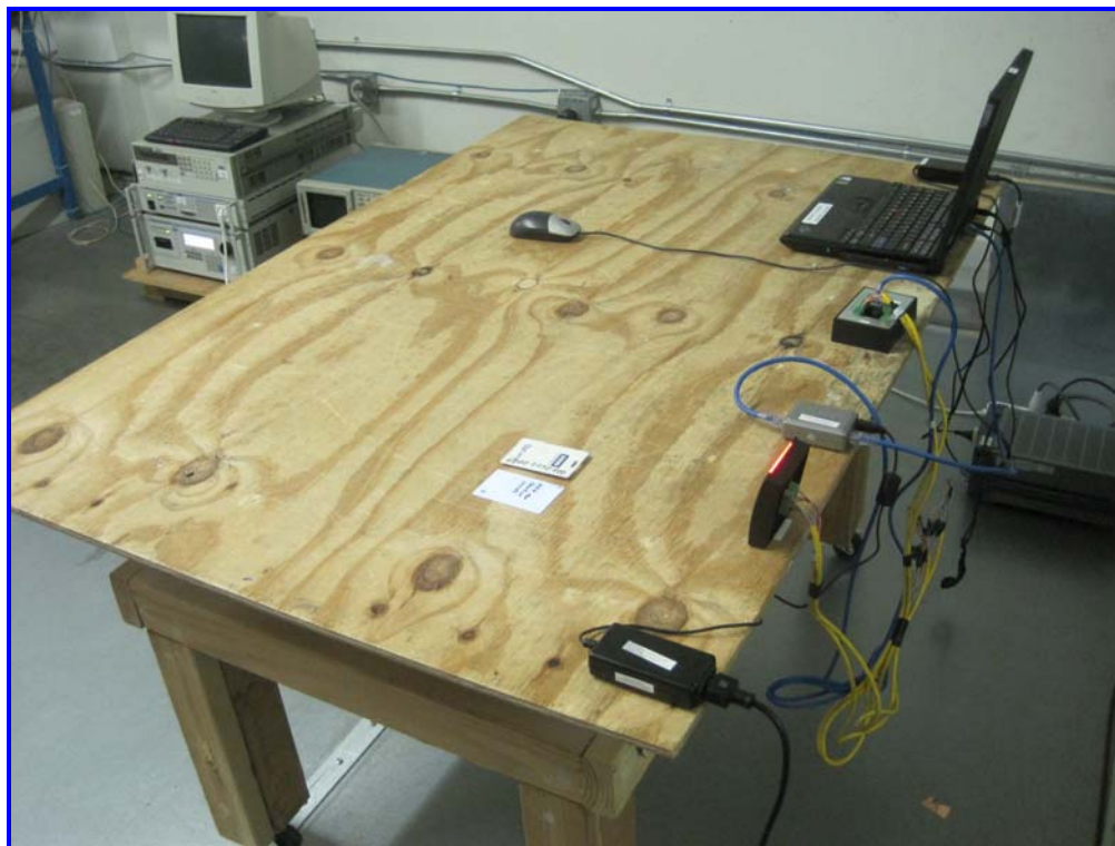
AC Line Conducted Emission - Front View