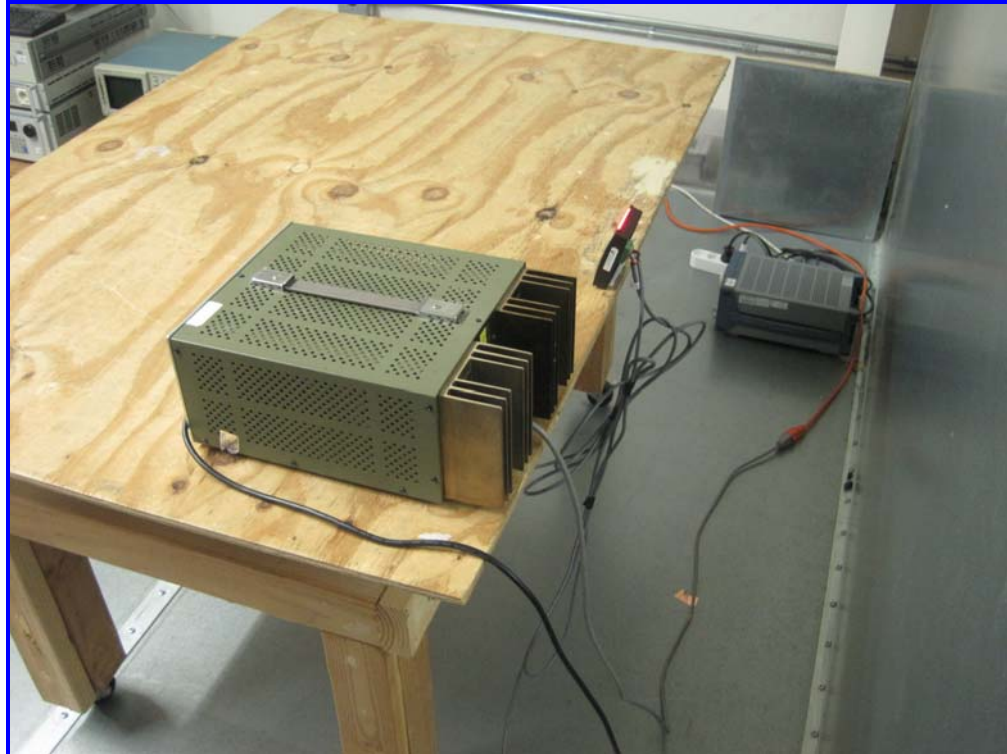
DC Line Conducted Emission - Front View