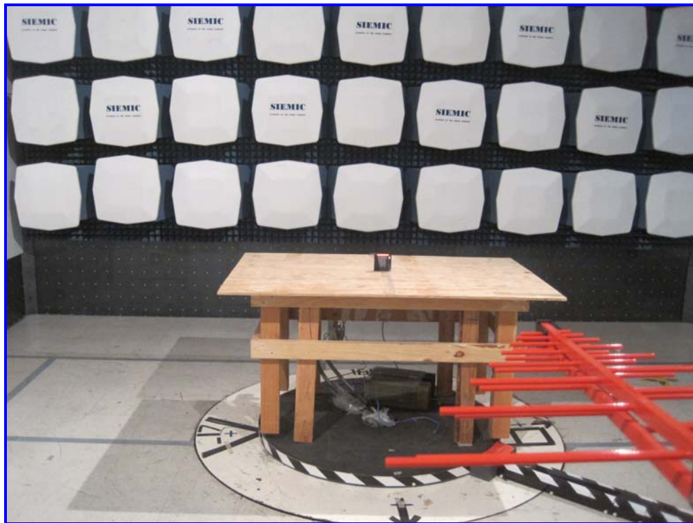
Radiated Emission (>30MHz) – Front View