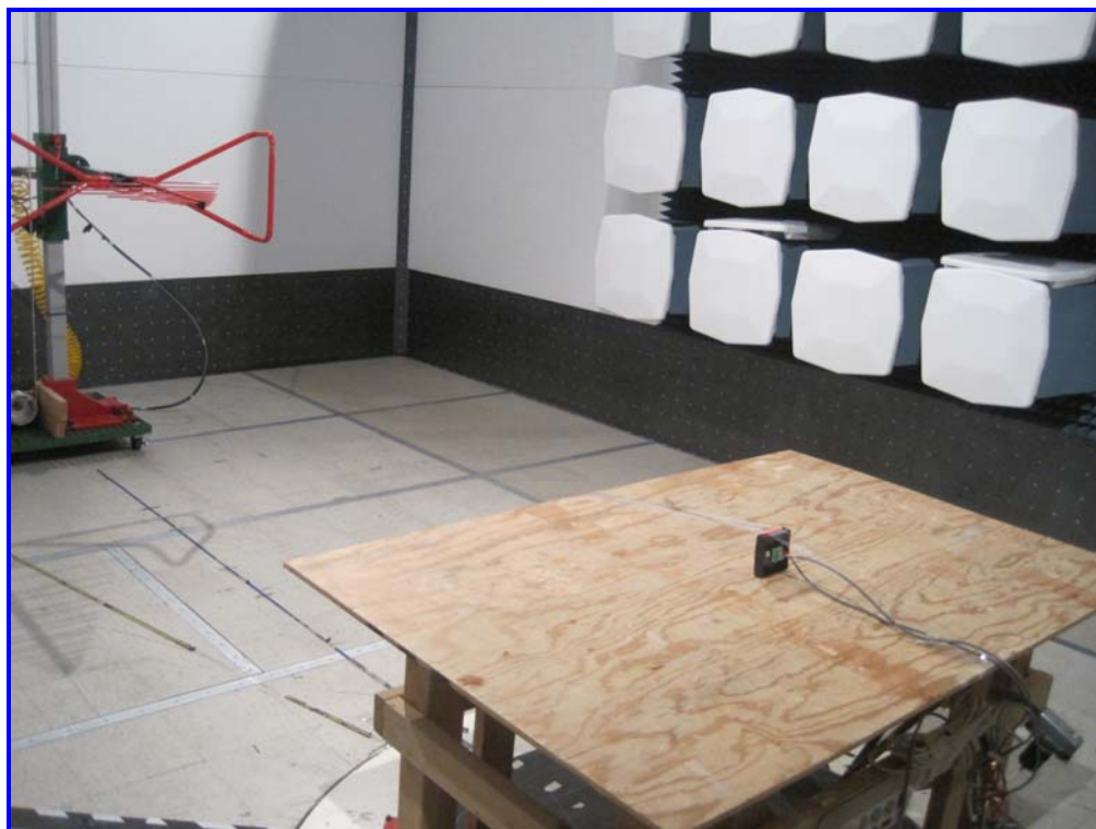
Radiated Emission (>30MHz) – Rear View