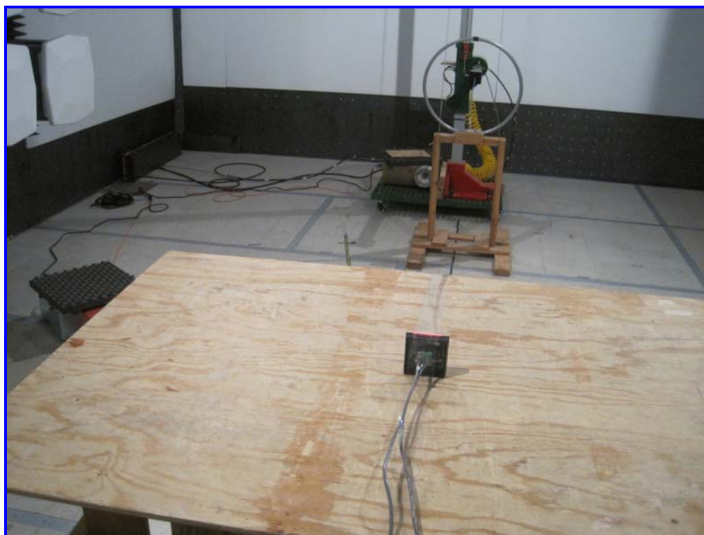
Radiated Emission (<30MHz) – Rear View