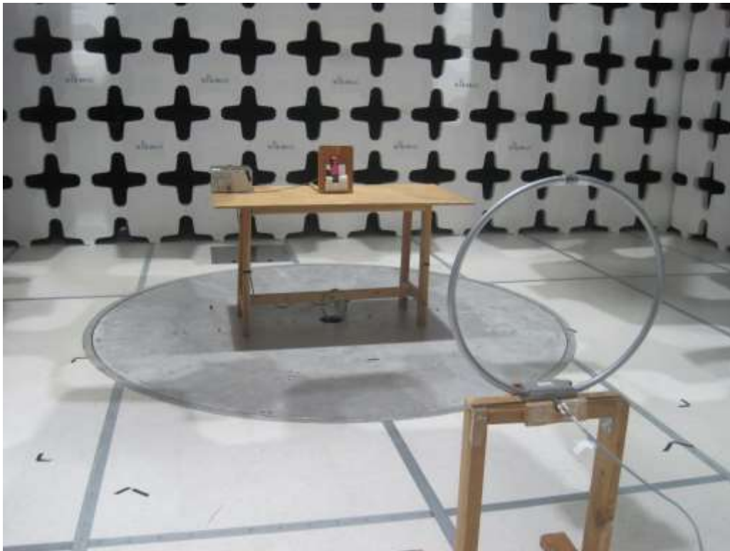
Radiated Emission (<30MHz) – Front View