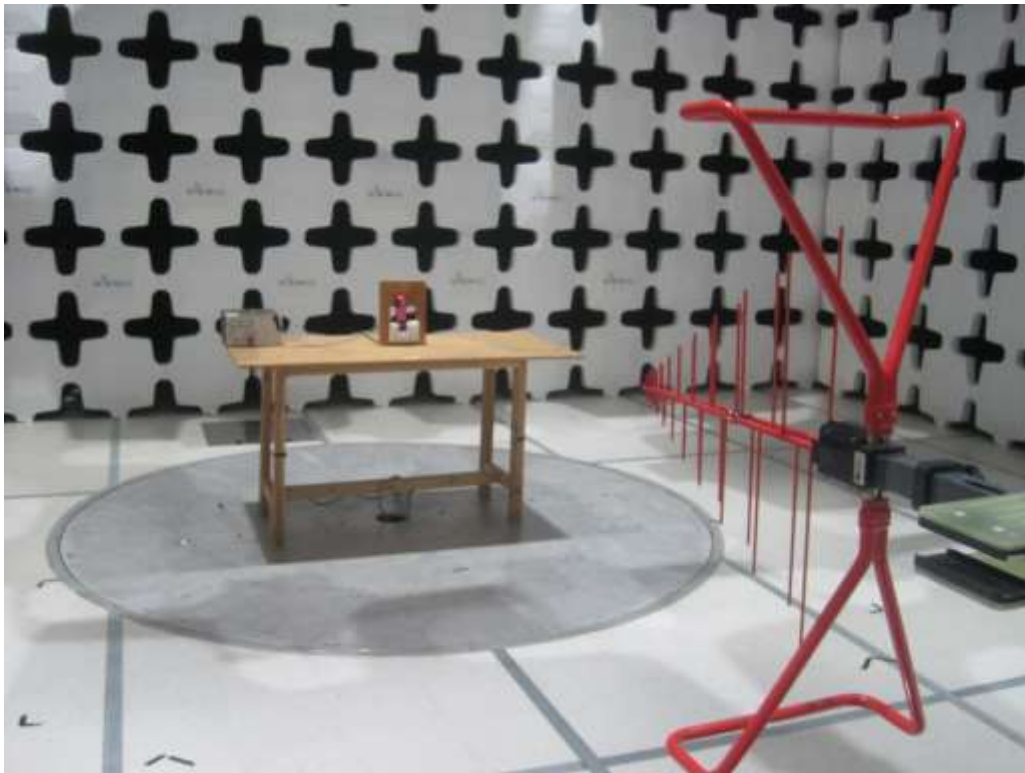
Radiated Emission (>30MHz) – Front View