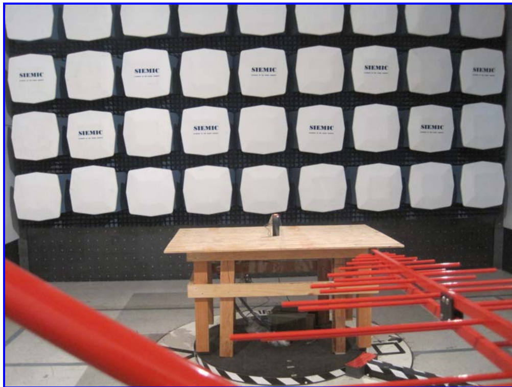
Radiated Emission (>30MHz) – Front View