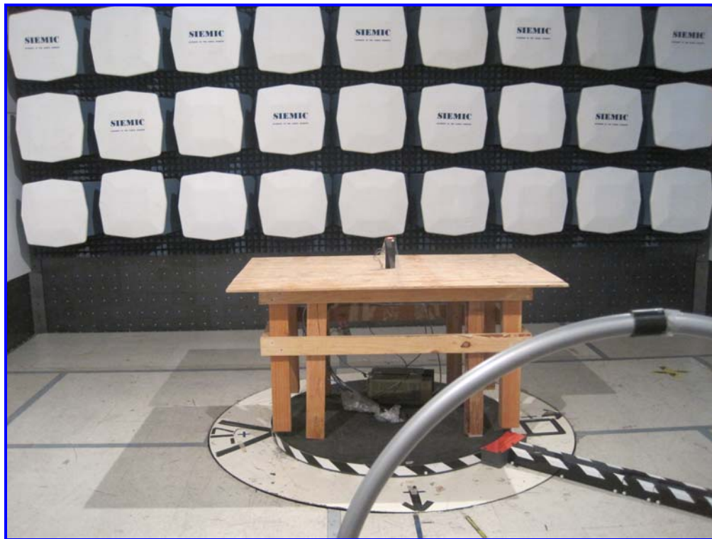
Radiated Emission (<30MHz) – Front View