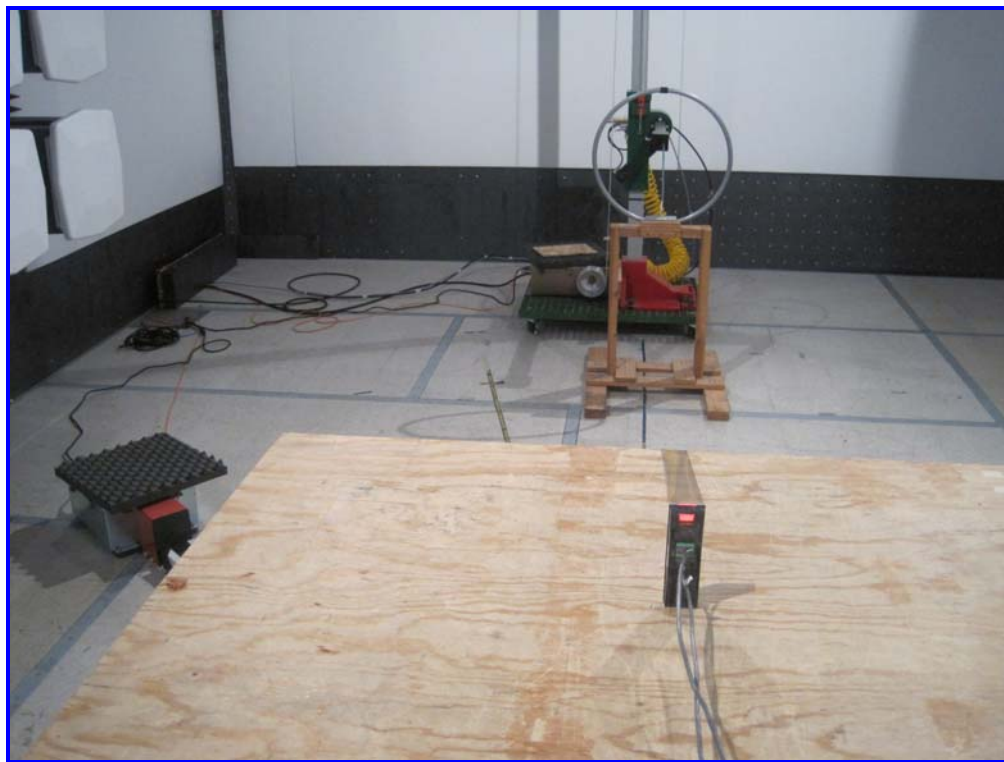
Radiated Emission (<30MHz) – Rear View