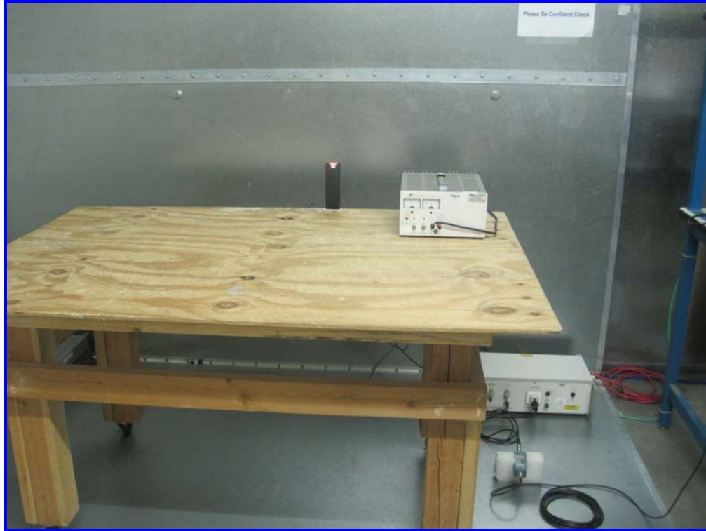
DC Line Conducted Emission - Front View