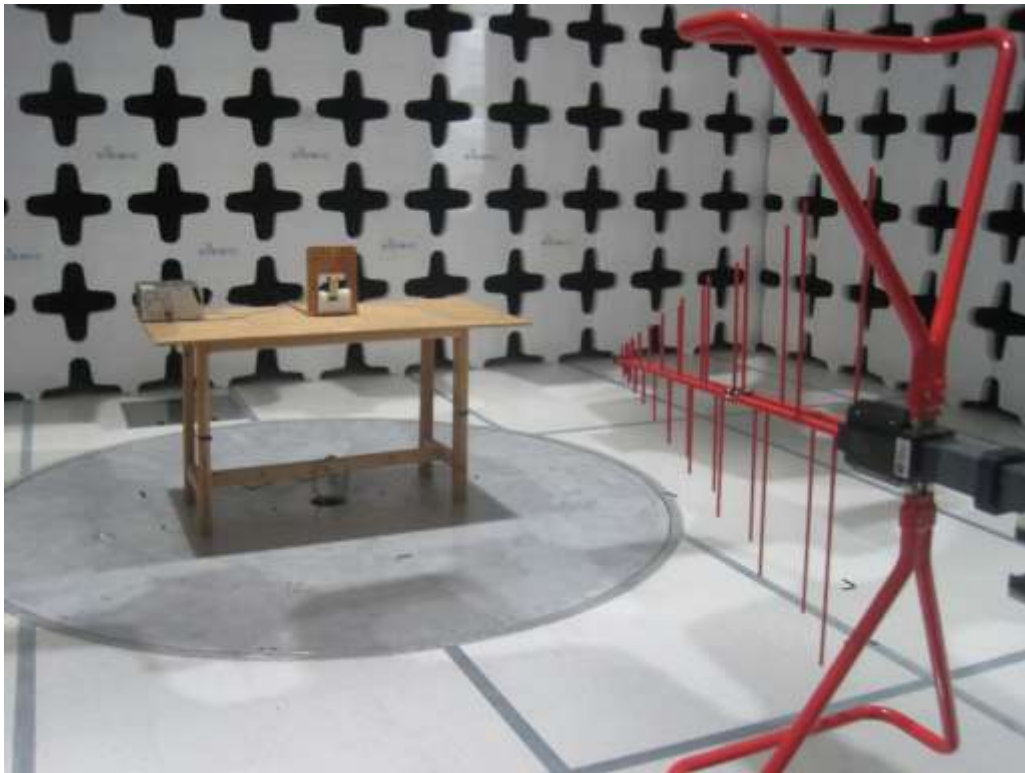
Radiated Emission (>30MHz) – Front View