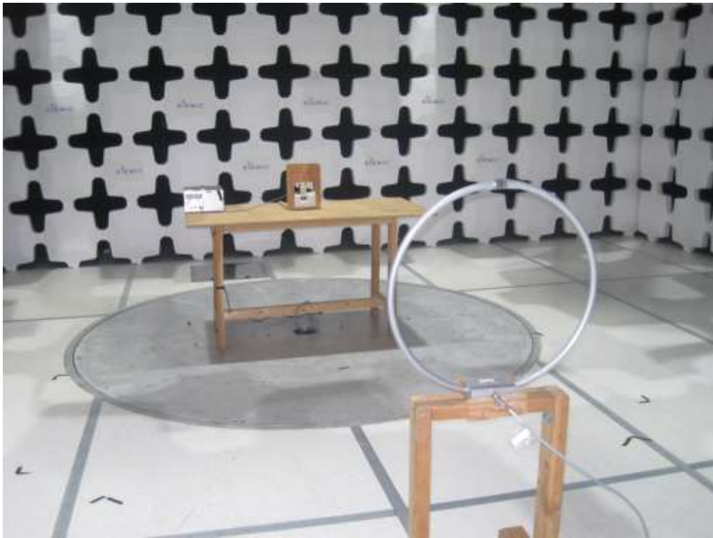
Radiated Emission (<30MHz) – Front View