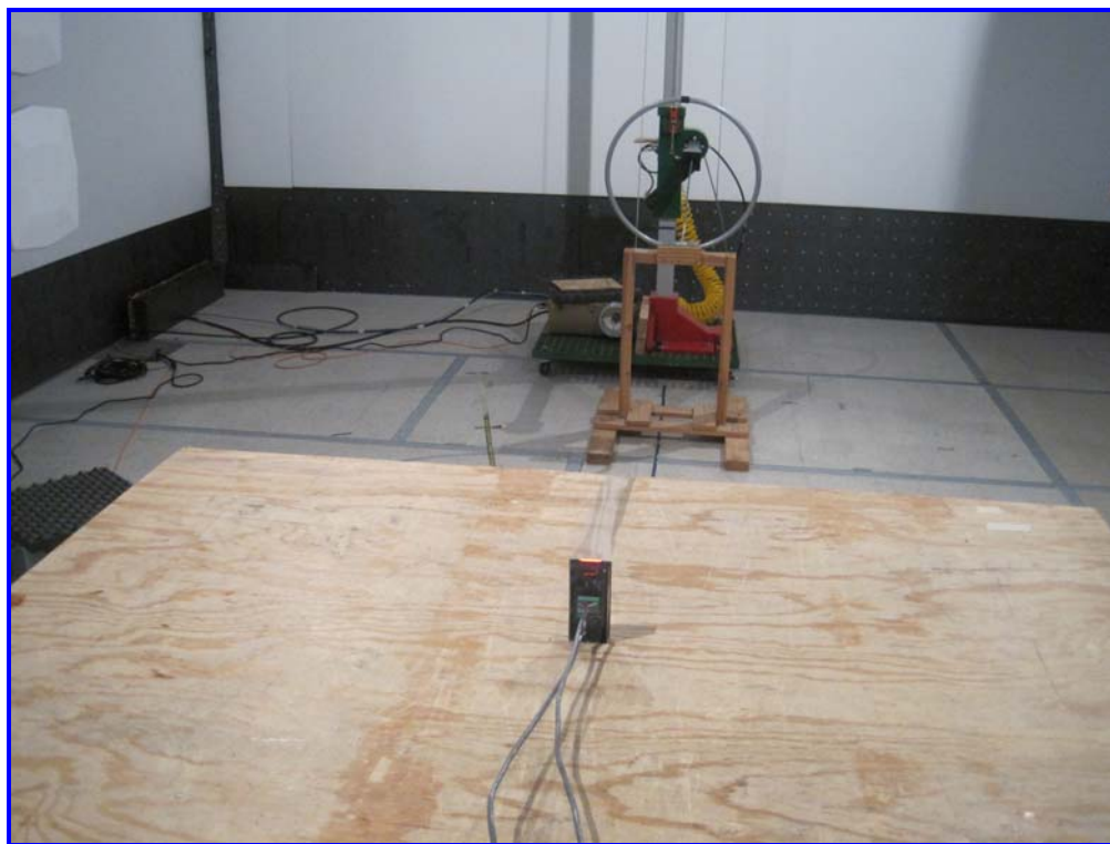
Radiated Emission (<30MHz) – Rear View