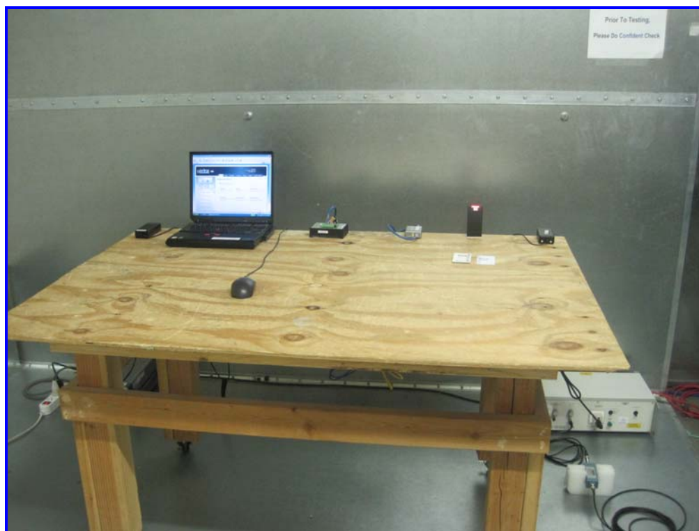
AC Line Conducted Emission - Front View