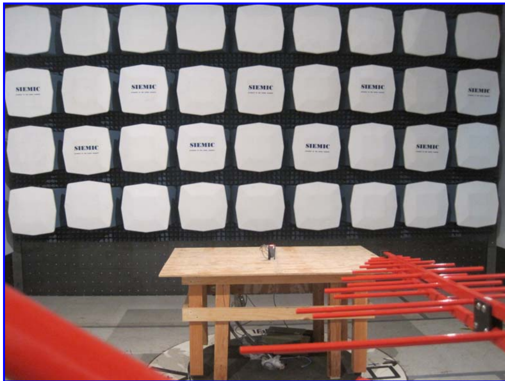
Radiated Emission (>30MHz) – Front View