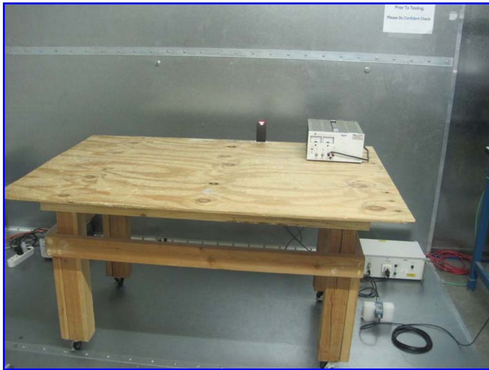
DC Line Conducted Emission - Front View