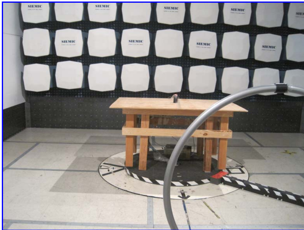
Radiated Emission (<30MHz) – Front View