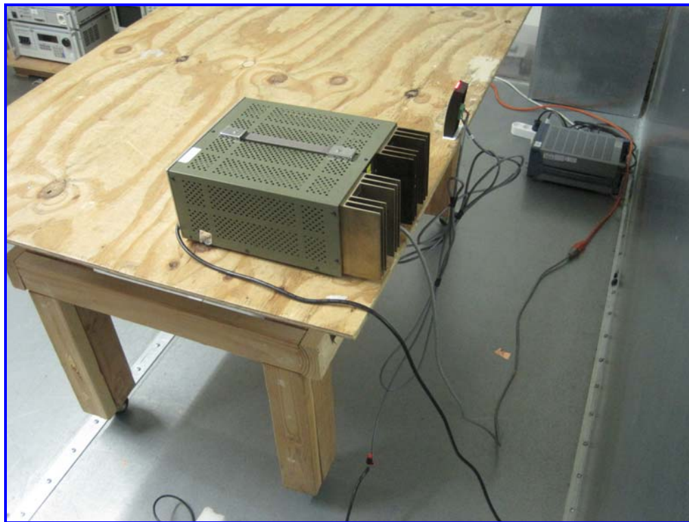
DC Line Conducted Emission - Front View