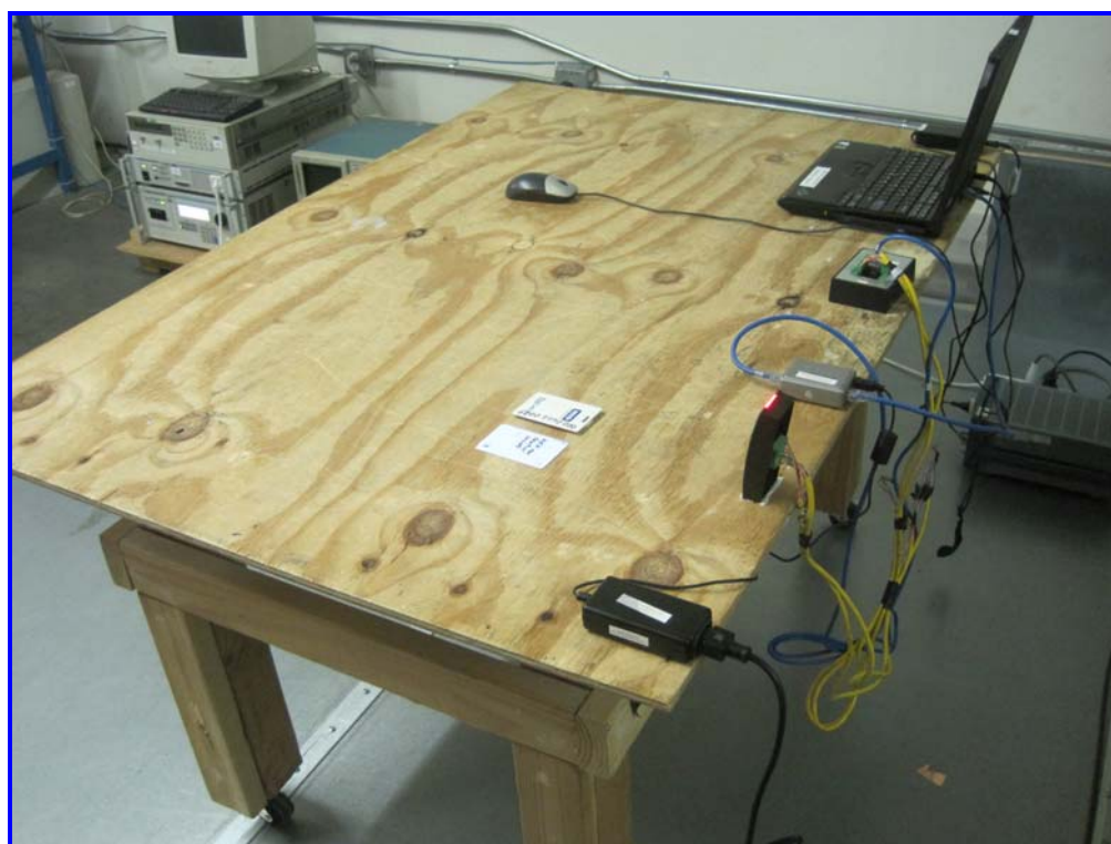
AC Line Conducted Emission - Front View