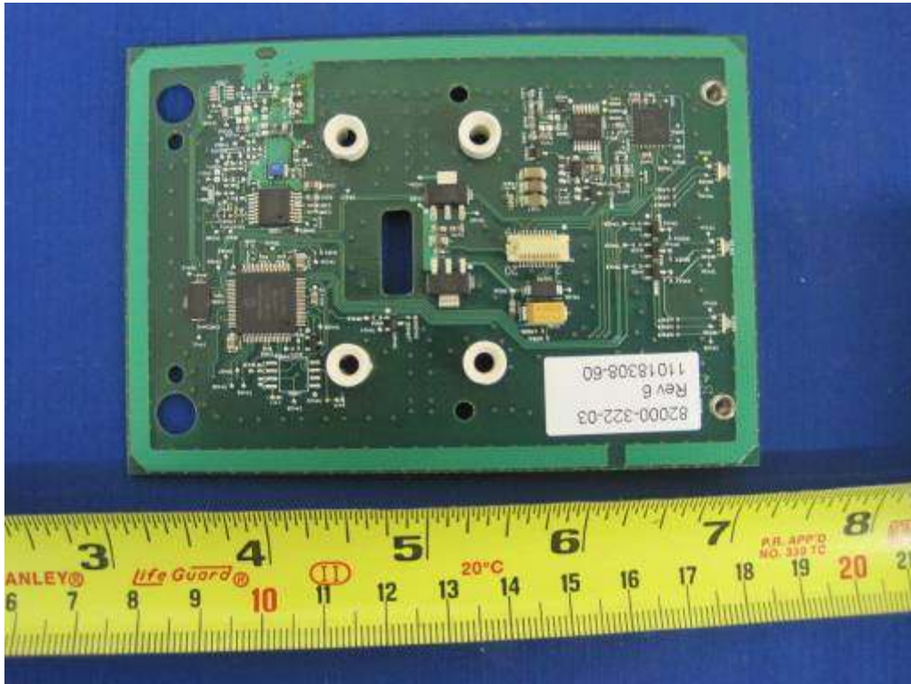
Radio Board B – Bottom