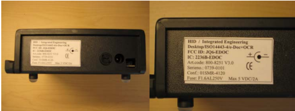
Backside of terminal

Samples of identification label on the product: