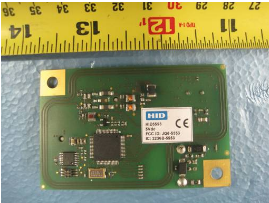
PCB Top View