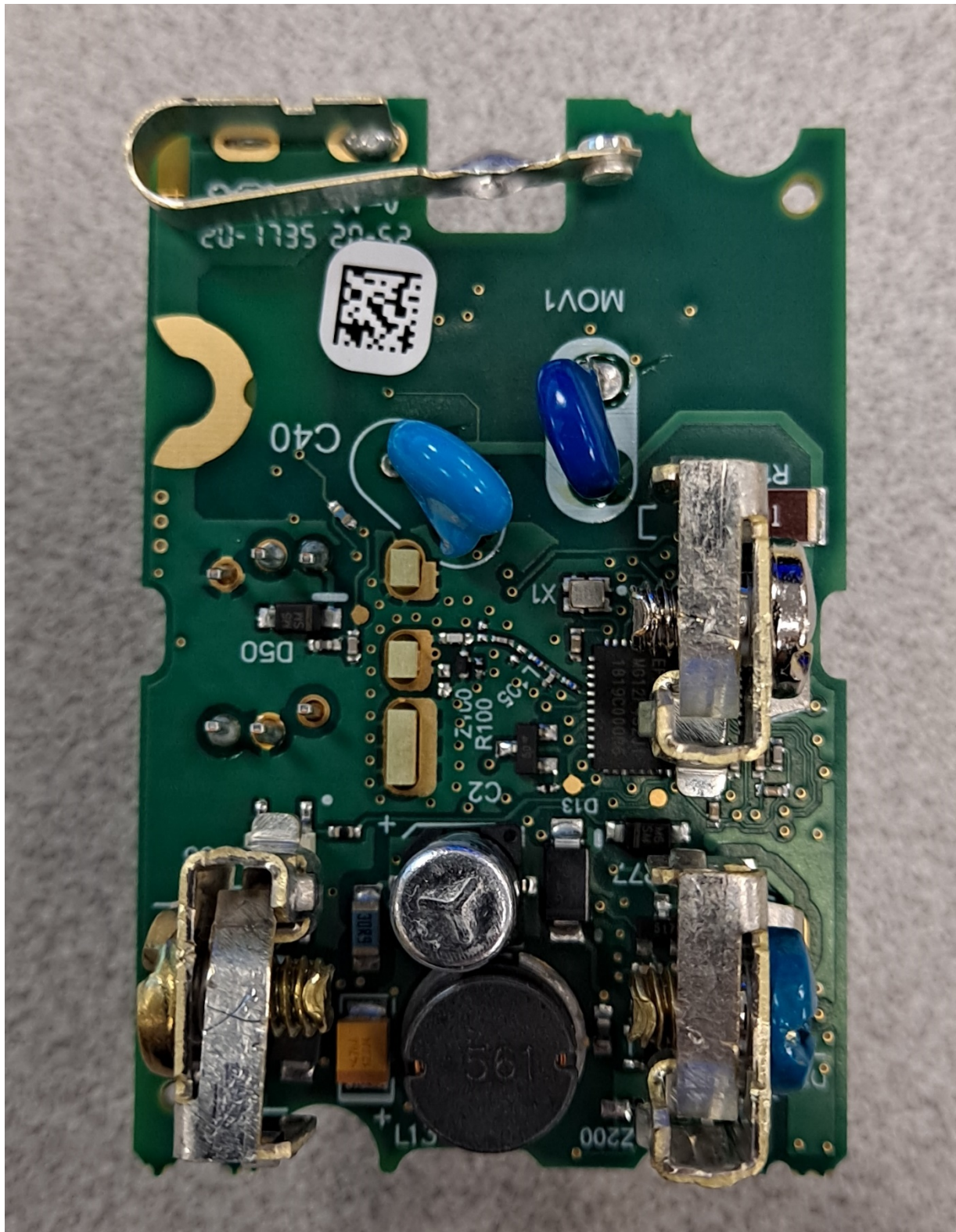
PCB- Bottom View