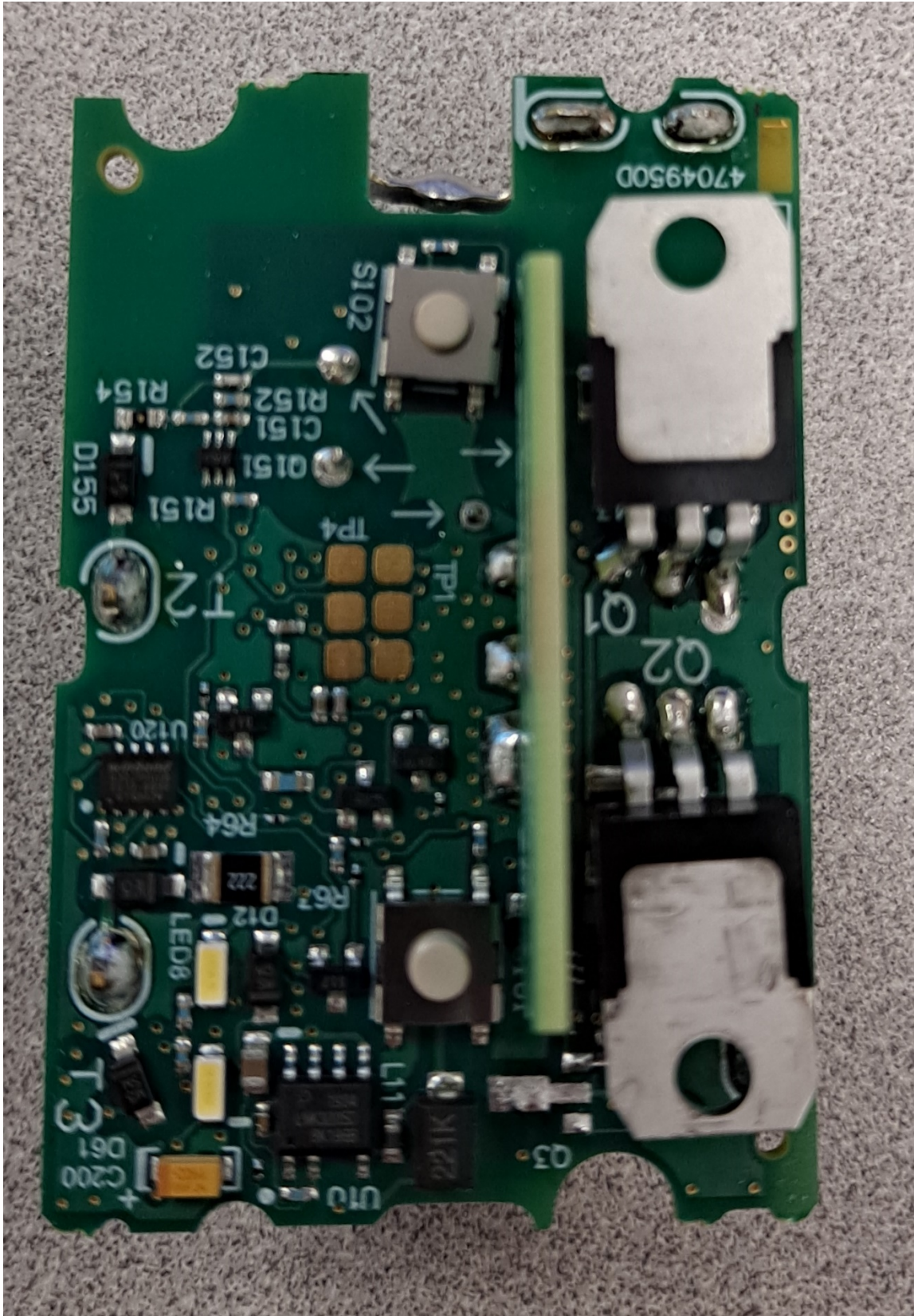
PCB TOP View