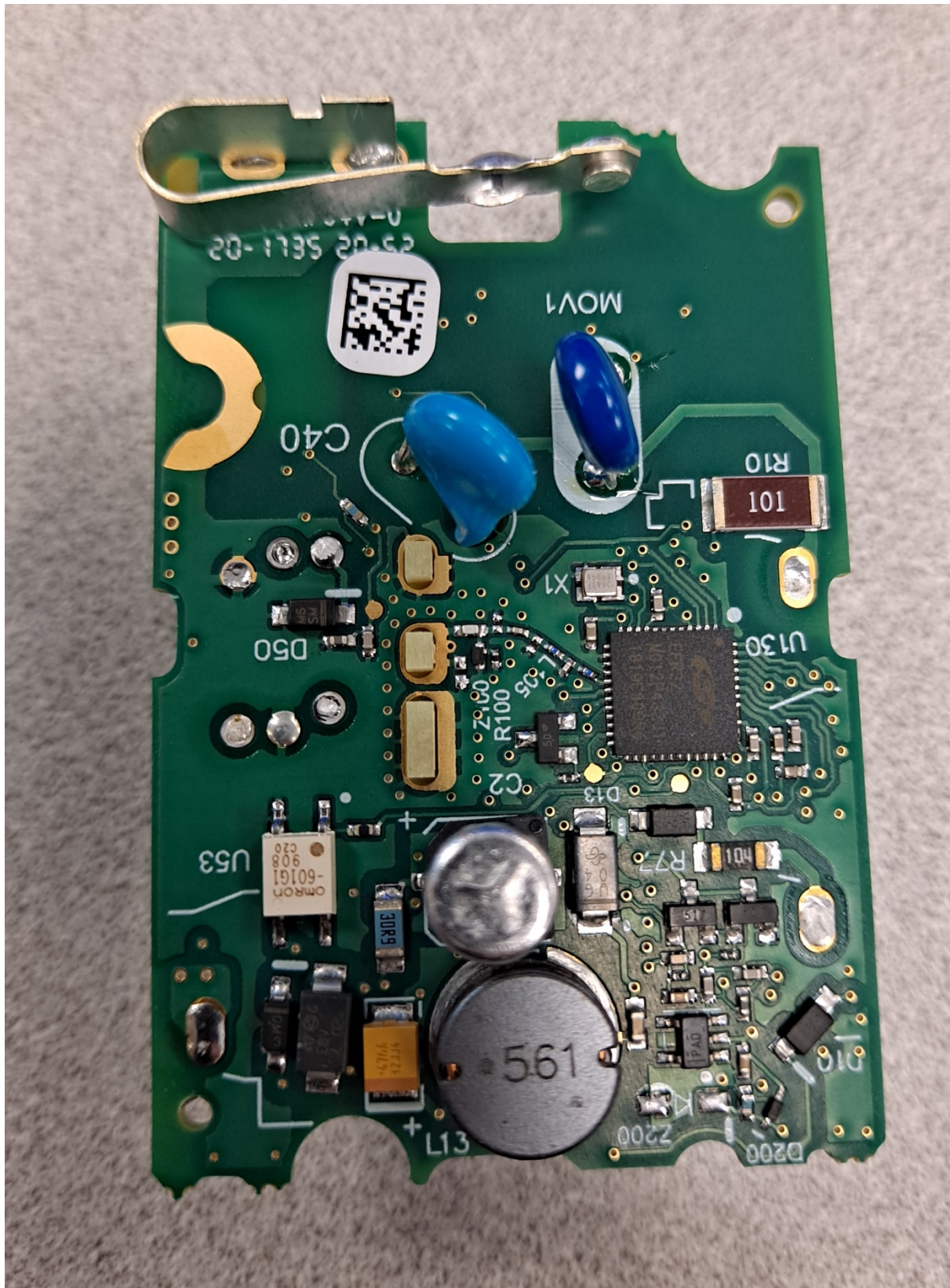
PCB- Bottom View , Screw Terminals Removed