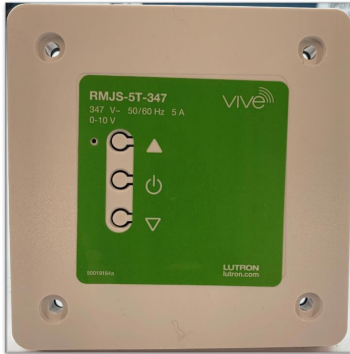
Front of Assembly