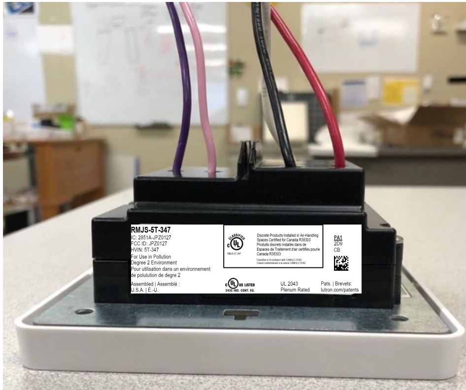
Right Side with Label Location