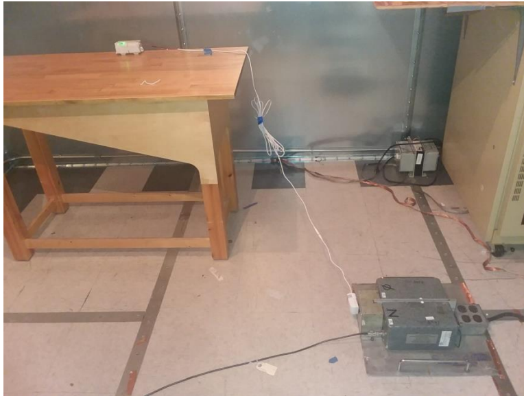
Figure 1: Conducted Emissions, Test Setup