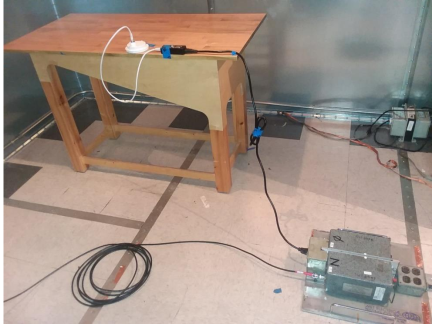
Figure 1: Conducted Emissions, Test Setup