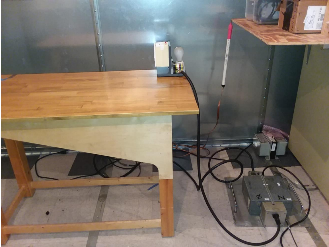
Photograph 1. Conducted Emissions, Test Setup