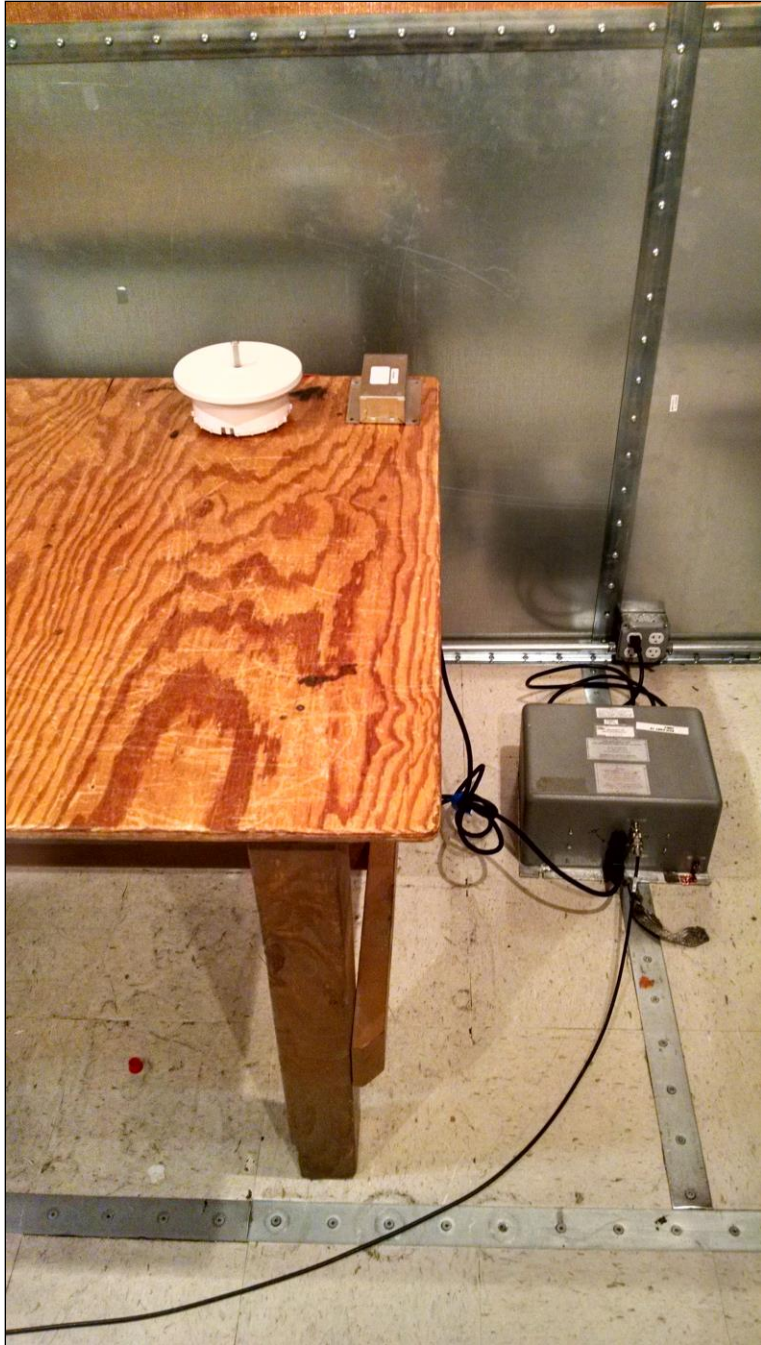
Photograph 1. Conducted Emissions, Test Setup