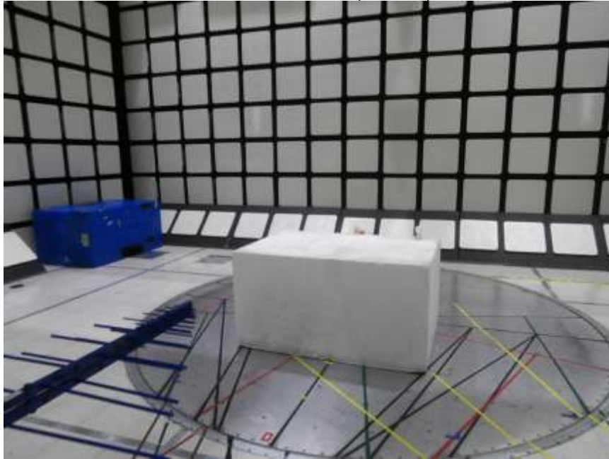
RADIATED EMISSIONS ABOVE 30 MHz (FRONT)