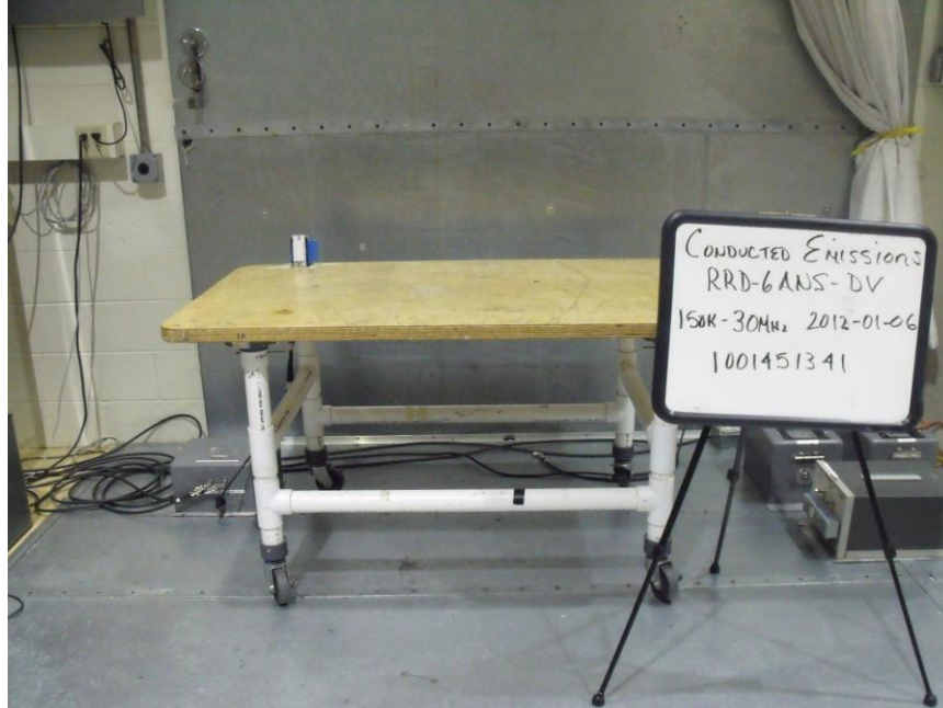
LINE CONDUCTED EMISSION (FRONT)