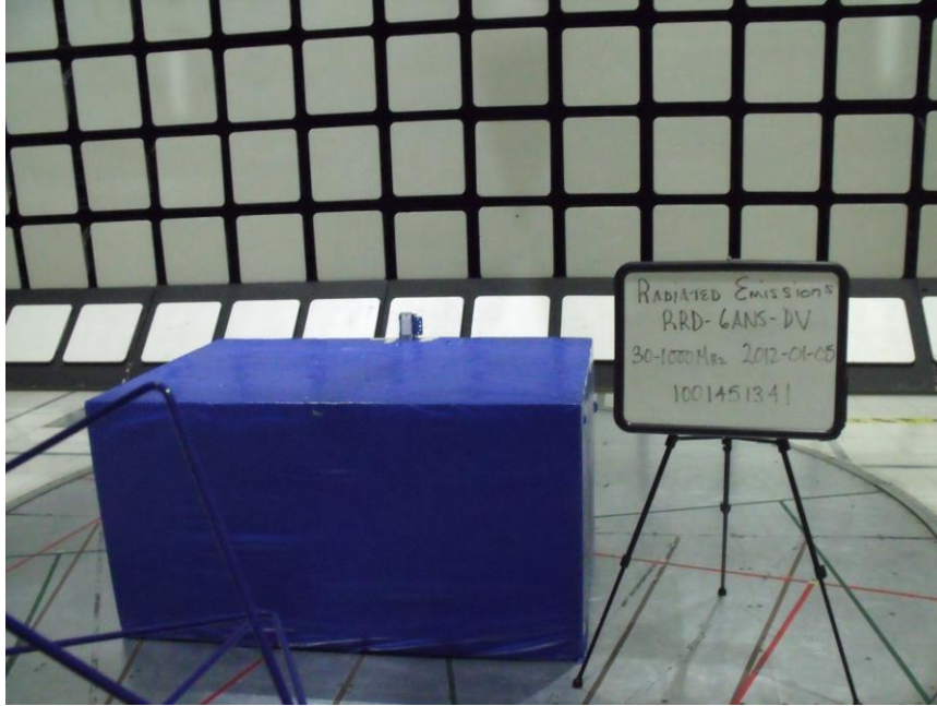
RADIATED EMISSIONS ABOVE 30 MHz (FRONT)