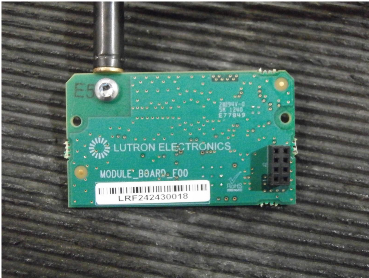
RF Board - Bottom