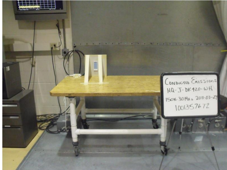
Figure 1 Test Setup for Conducted Emissions