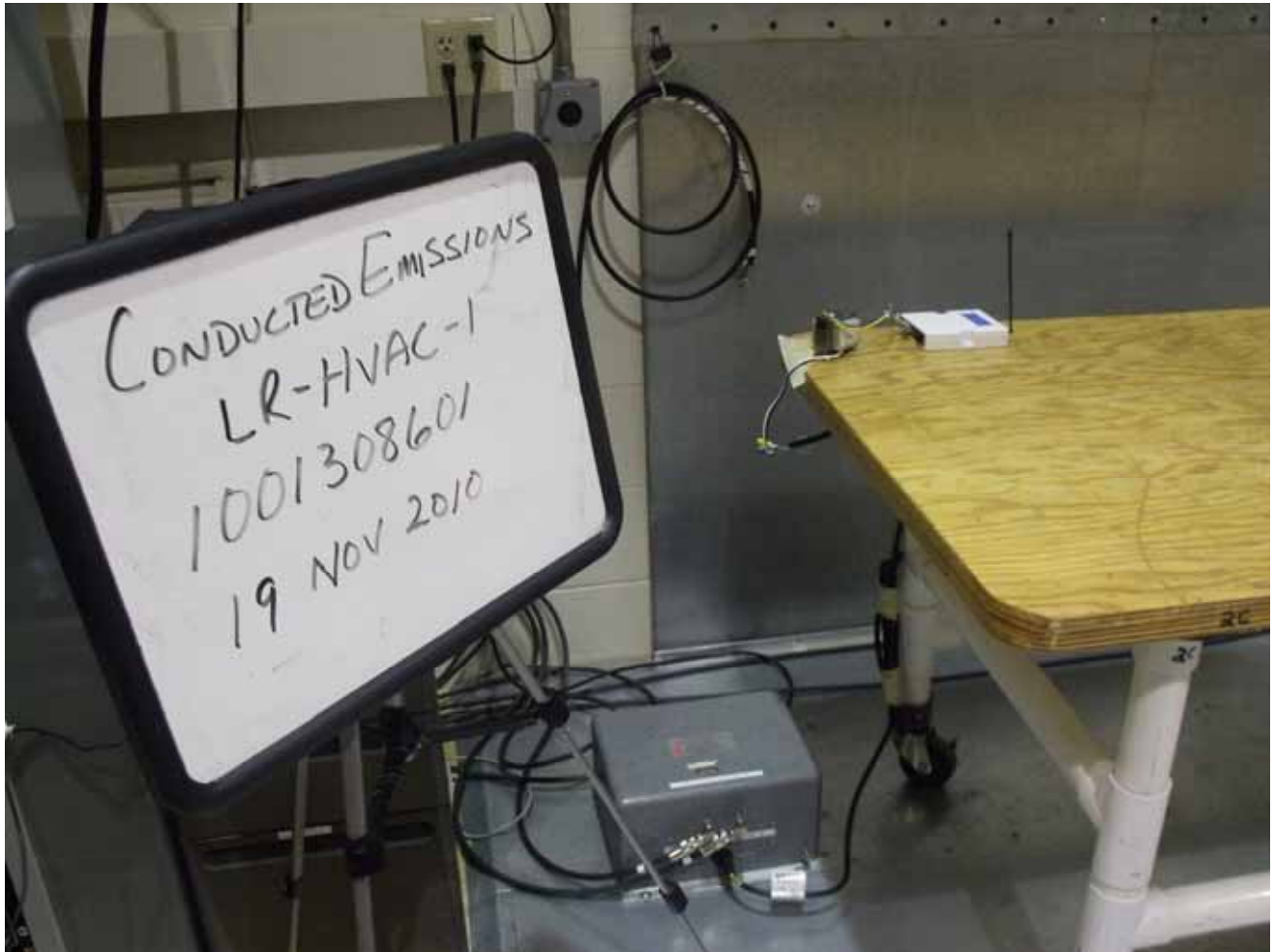
Figure 1 Test Setup for Conducted Emissions