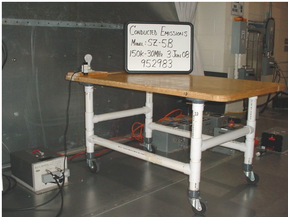
Figure 1 Test Setup for Conducted Emissions