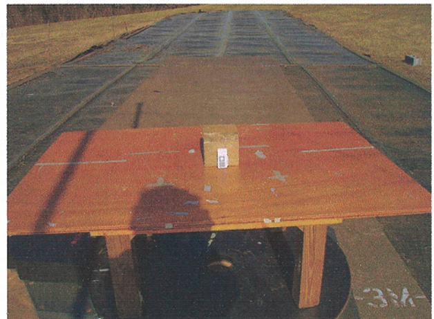
Radiated Emissions Test Setup in 3 Orthogonal Axis (Transmitter) Photographs Figure 8