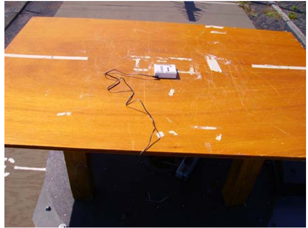
EUT test configuration