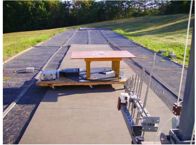
Log-Periodic Freq. 200-1000MHz