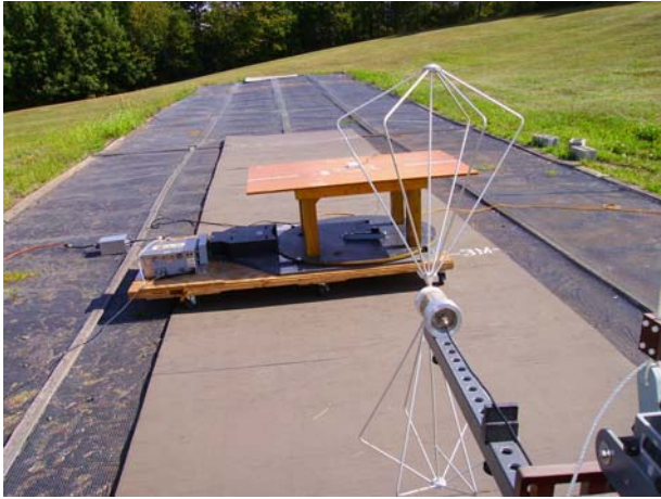
Biconical antenna freq. 30-200MHz