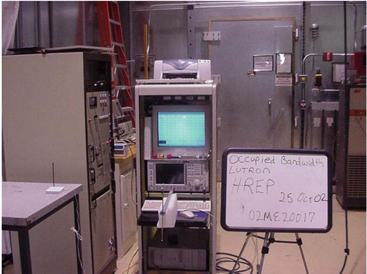
Occupied Bandwidth Test Set-up HR-REP