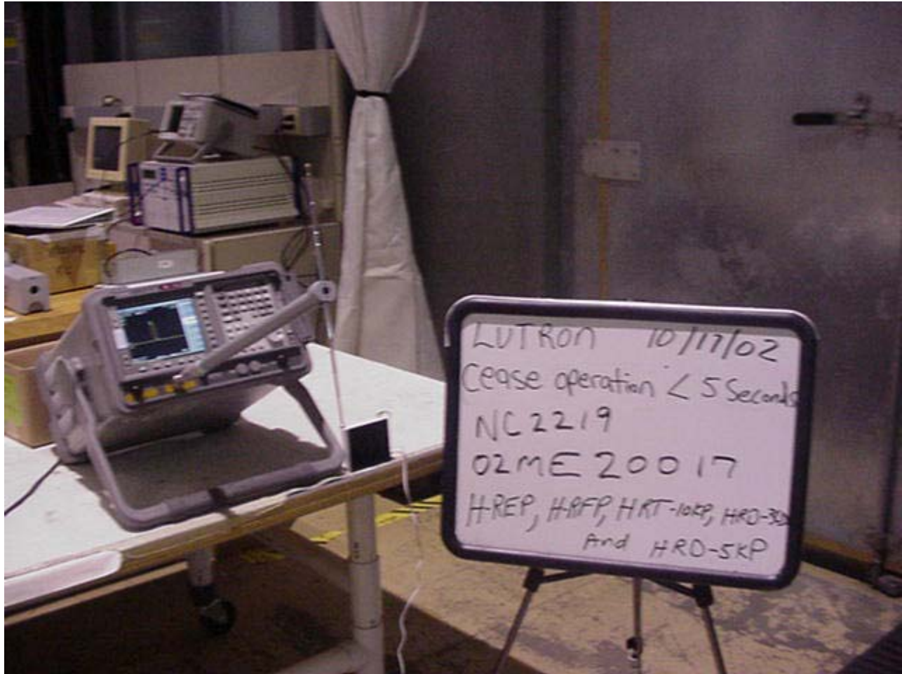
Test Set-Up Cease Operation < 5 seconds