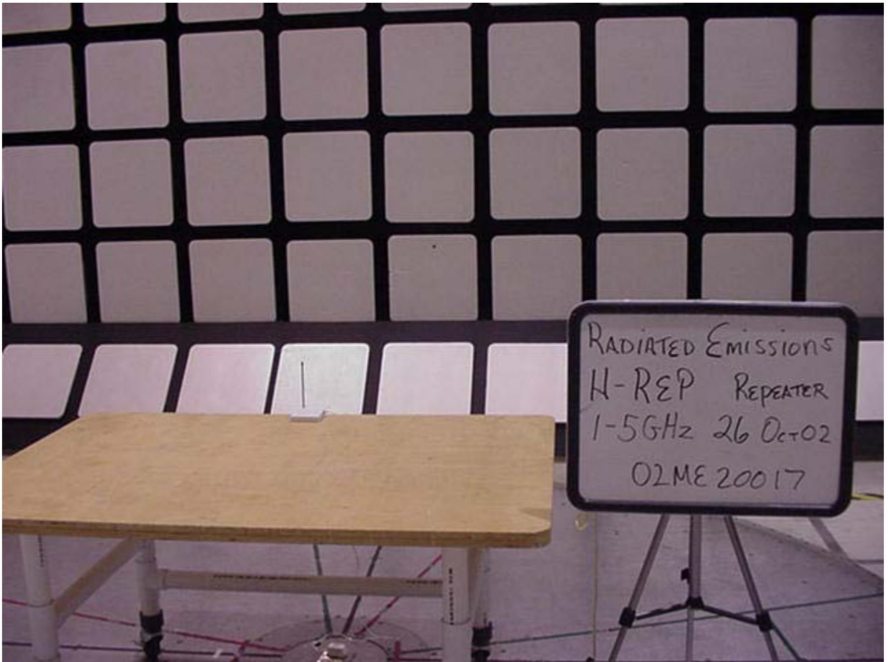
Radiated Emission Test Set-Up 1-5GHz Front View