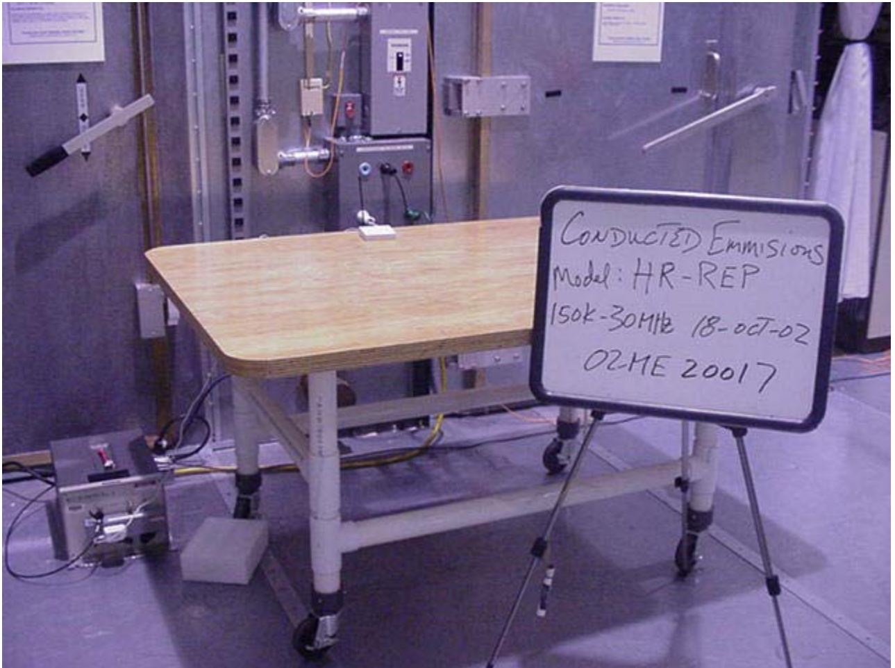
Conducted Emissions Test Set-Up 150k-30MHz