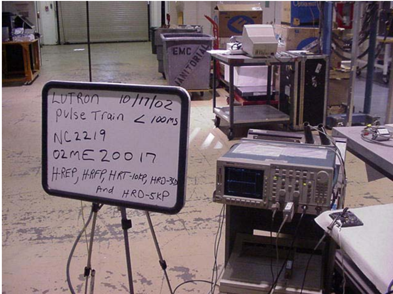
Pulse Train Test Set-Up