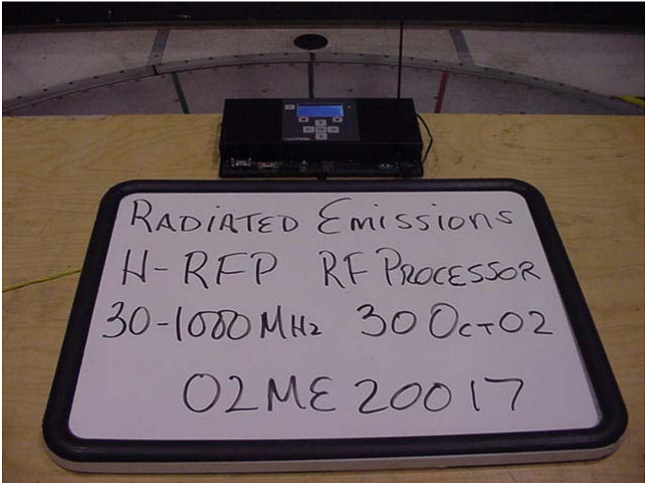
Radiated Emissions Test Set-Up 30-1000MHz