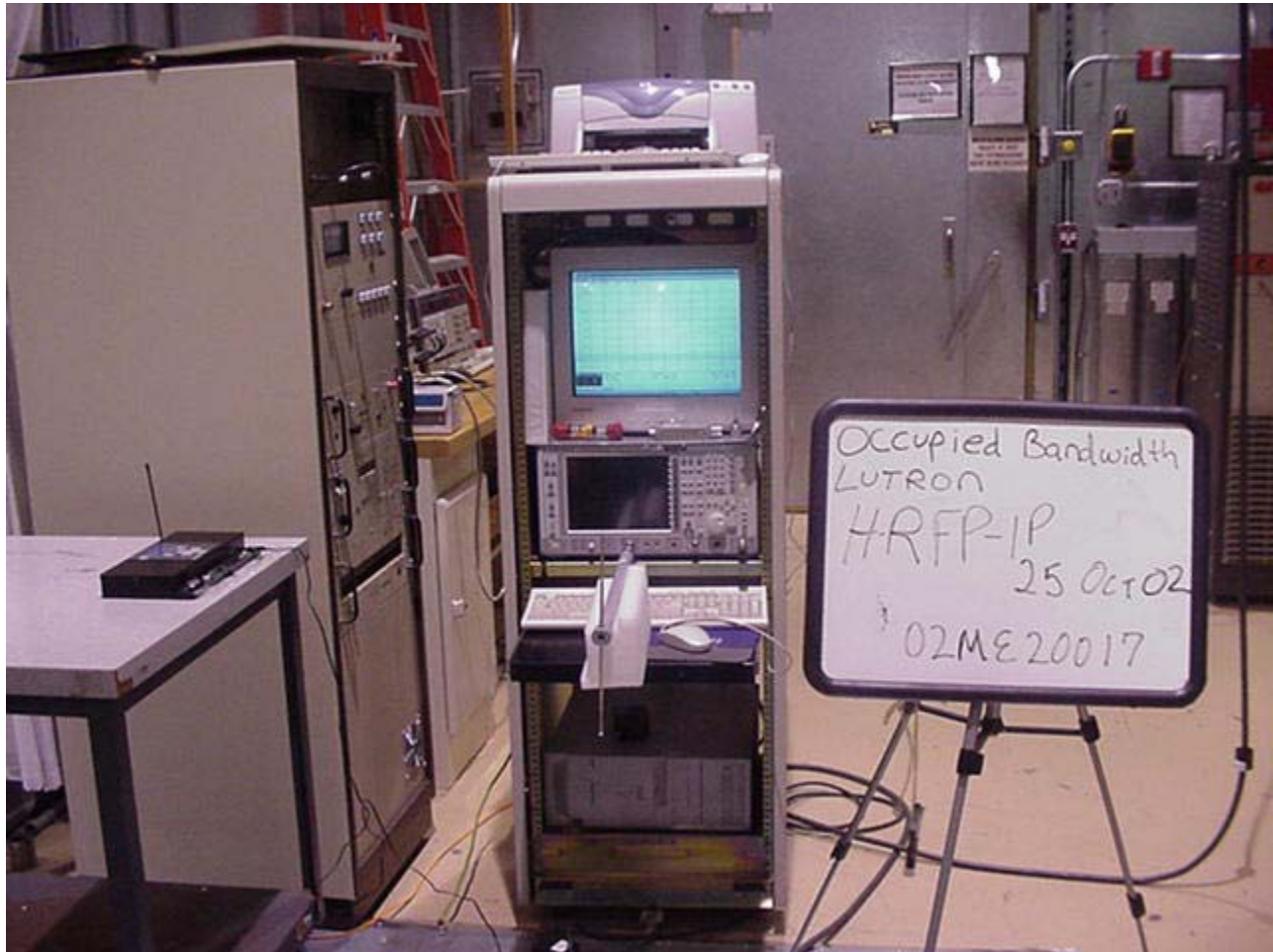
Occupied Bandwidth Test Set-up H-RFP-1P