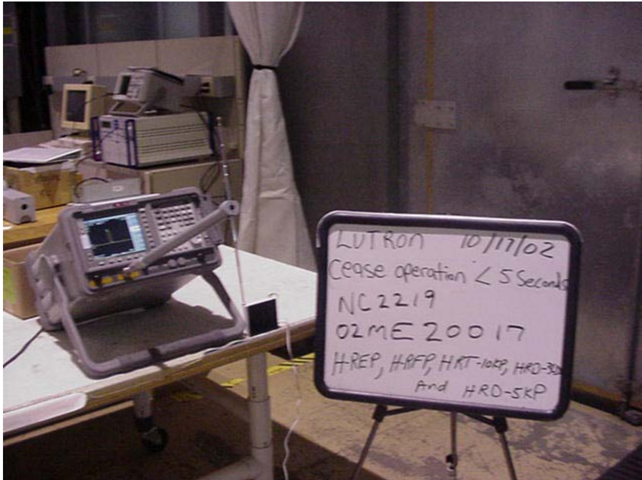
Test Set-Up Cease Operation < 5 seconds