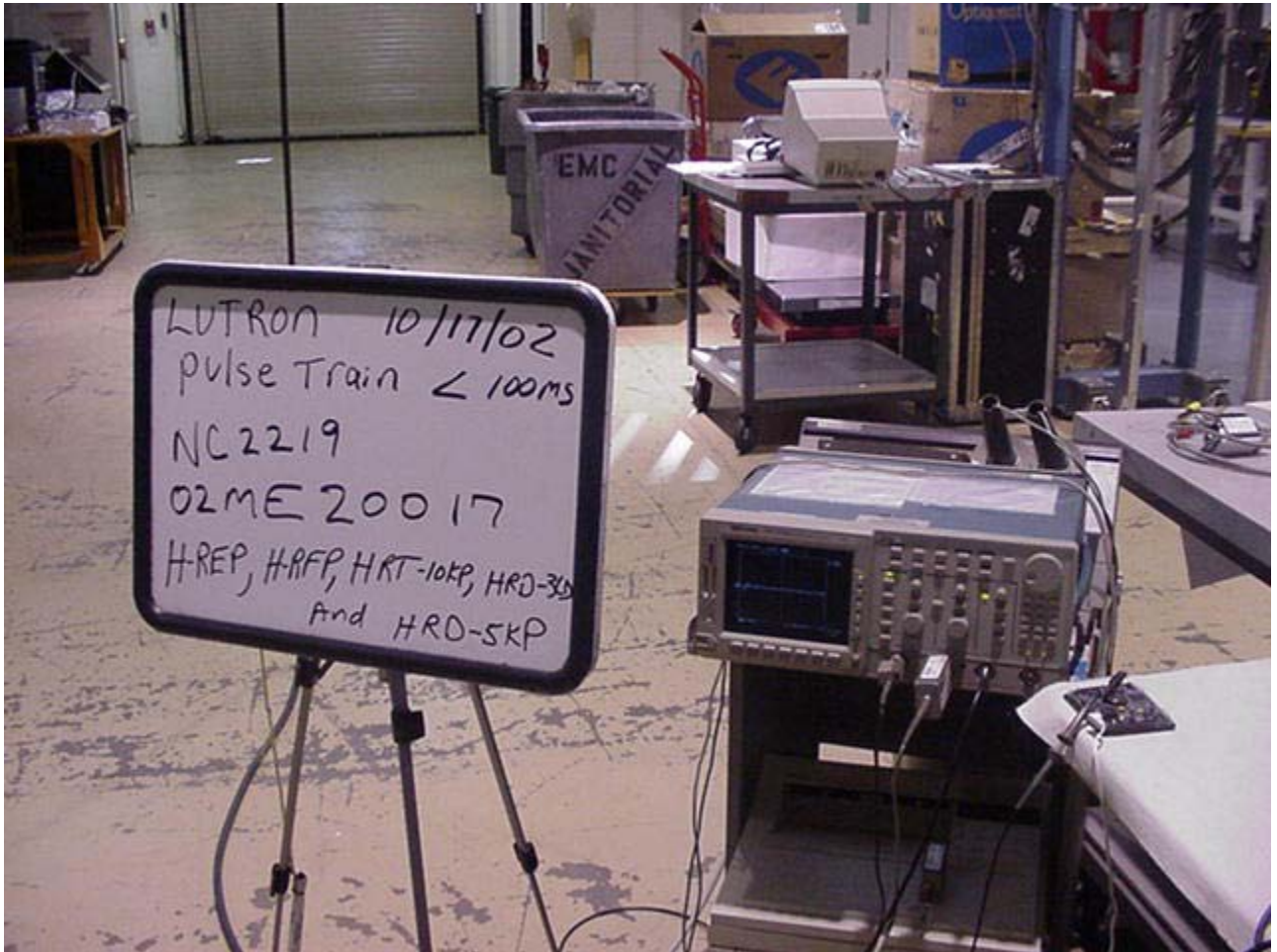
Pulse Train Test Set-Up