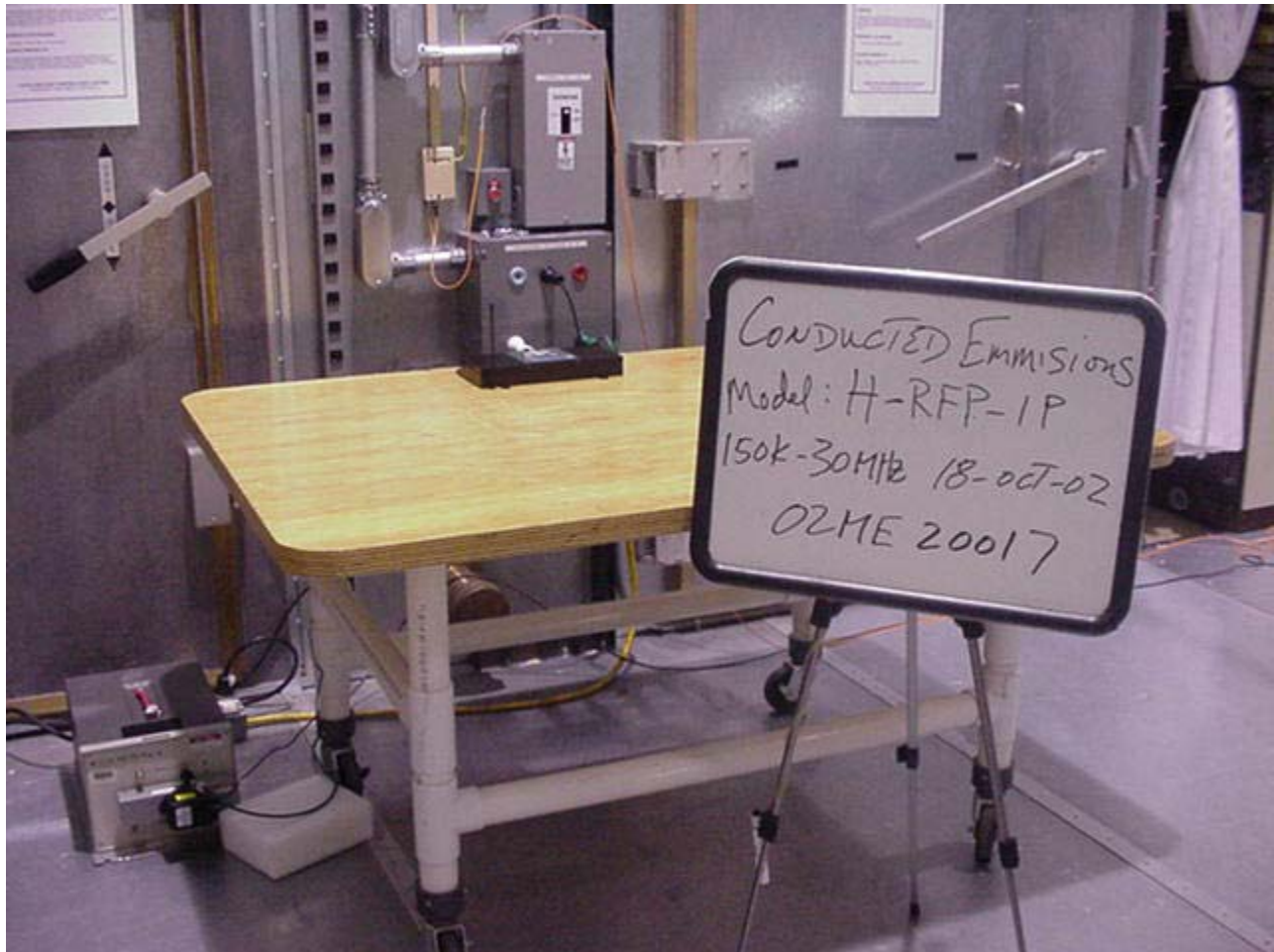
Conducted Emission Test Set-Up 150k-30MHz