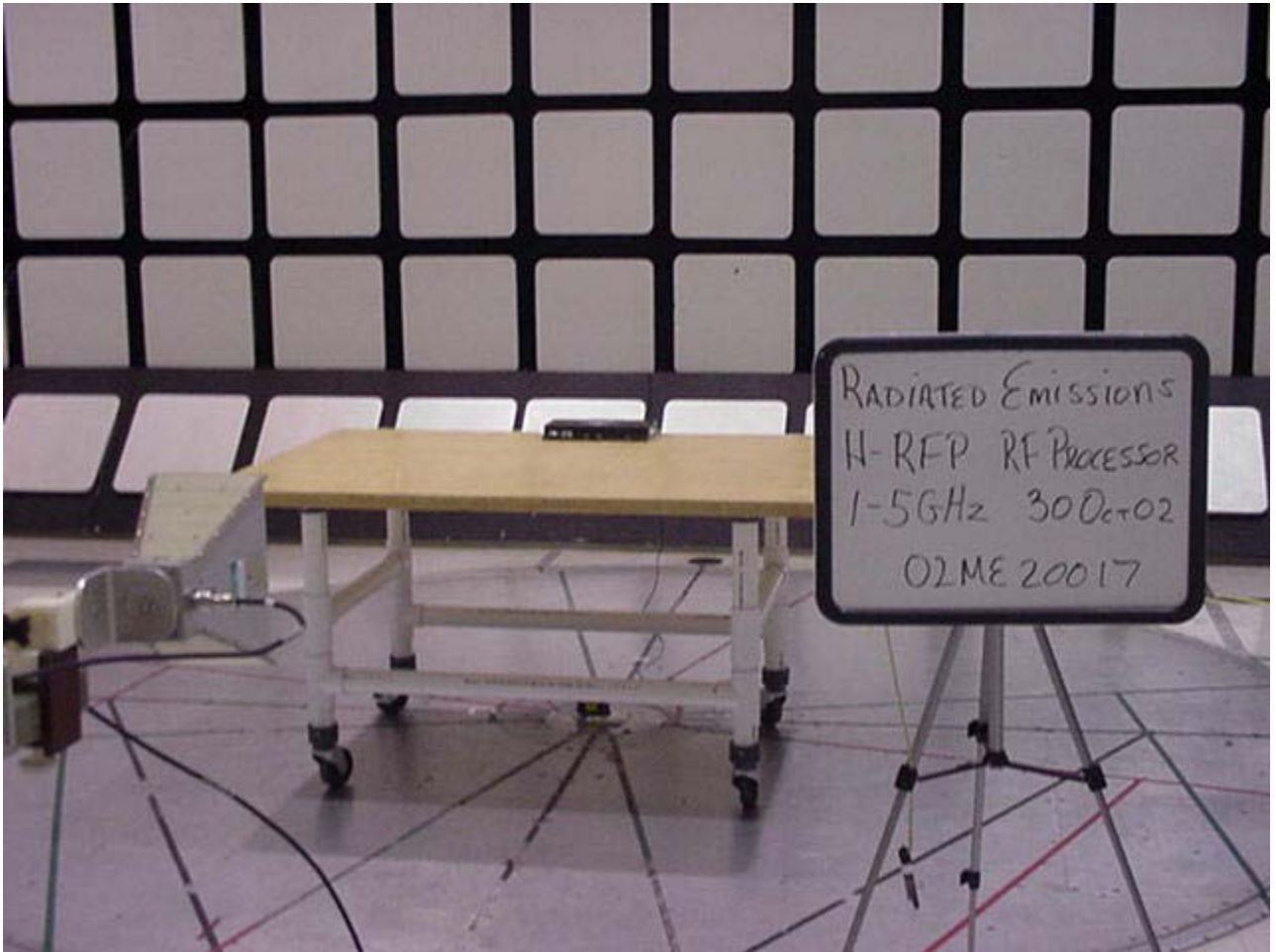
Radiated Emissions Test Set-Up 1-5GHz Front View