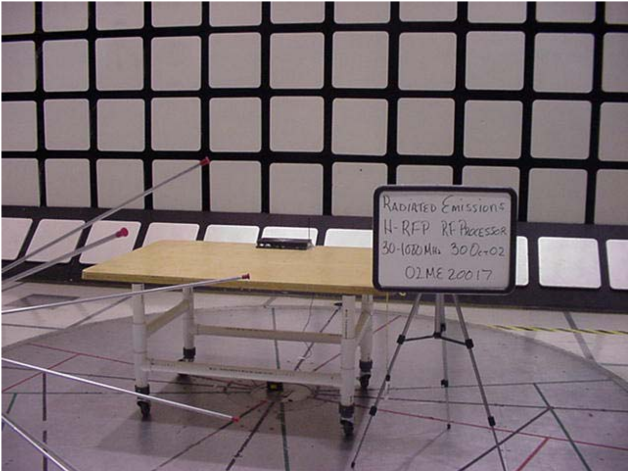
Radiated Emissions Test Set-Up 30-1000MHz Front View