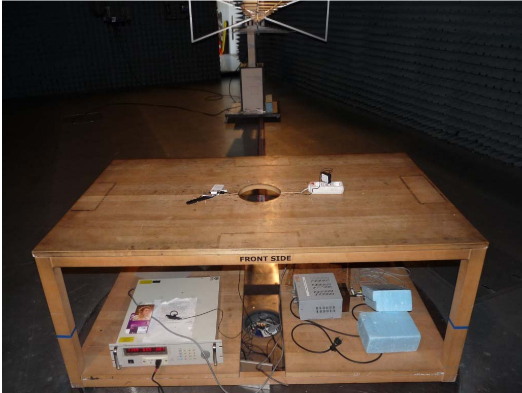
Photo 7: Test setup for radiated measurements (AC Port (power line), EUT supplied by AC/DC adapter, unintentional radiator S15)