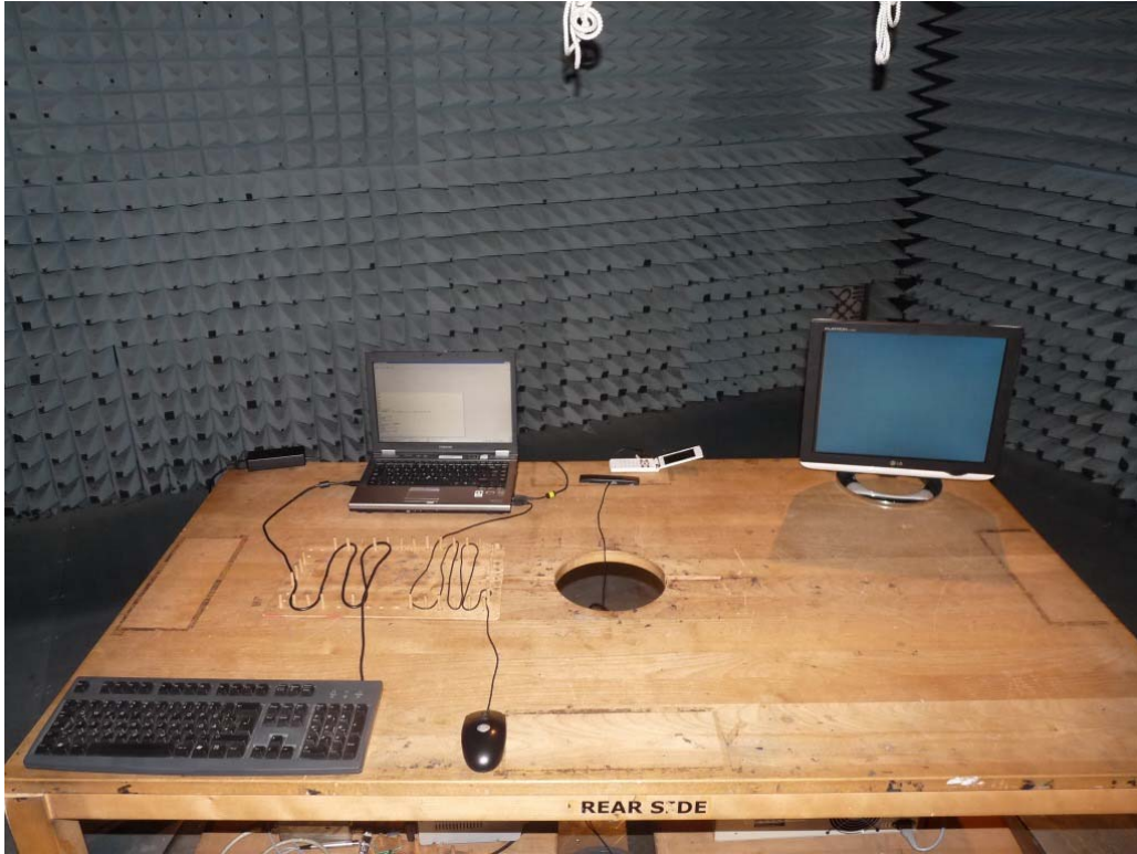
Photo 8: Test setup for radiated measurements (computer peripheral setup, EUT supplied by USB-cable from computer, unintentional radiator $15)