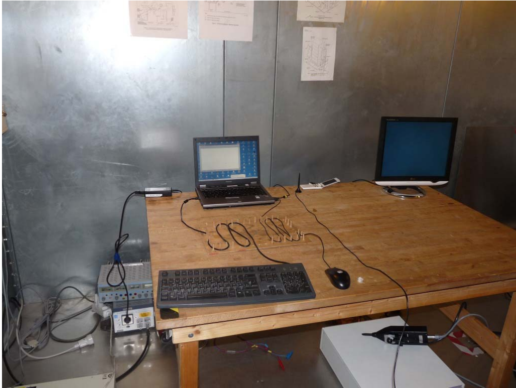
Photo 6: Test setup for conducted measurements (computer peripheral setup, EUT supplied by USB-cable from computer, unintentional radiator §15)