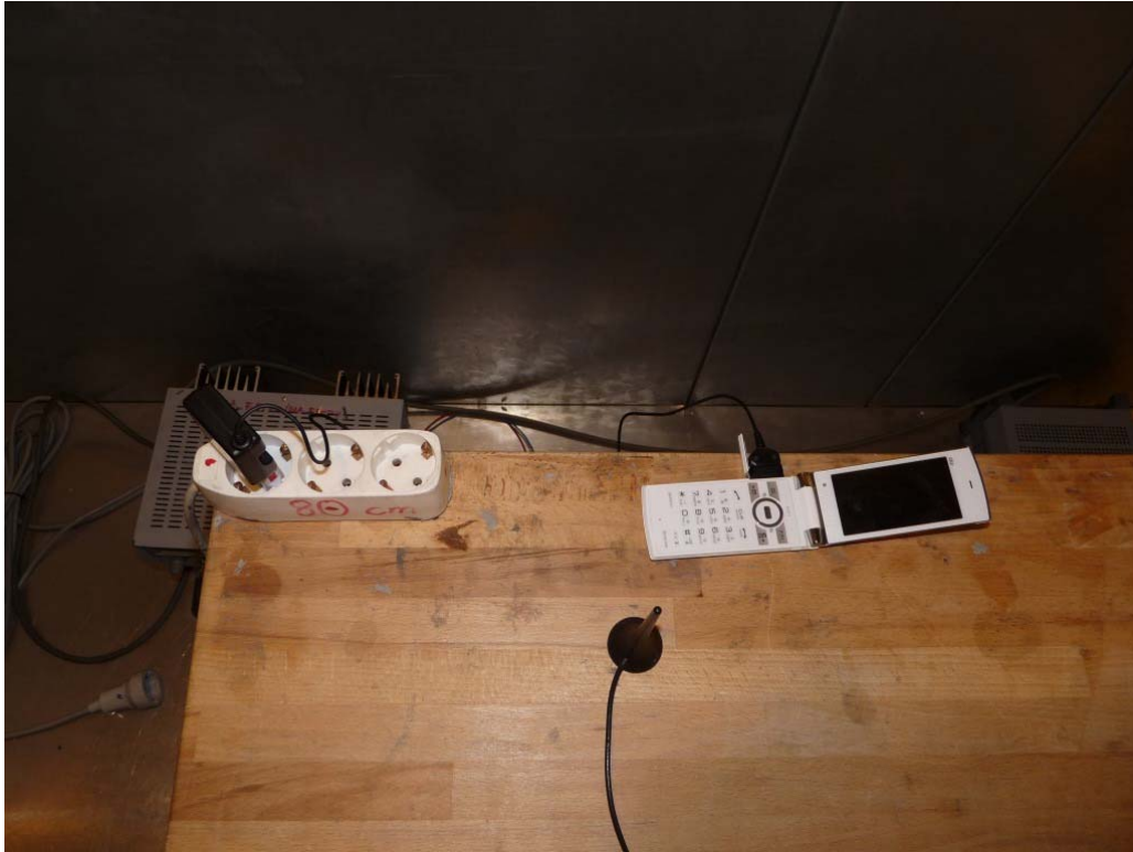
Photo 5: Test setup for conducted measurements (AC Port (power line), EUT supplied by AC/DC adapter, intentional / unintentional radiator §15)