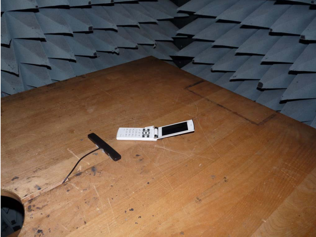
Photo 1: Test setup for radiated measurements (Enclosure, below 30 MHz, intentional radiator §15)