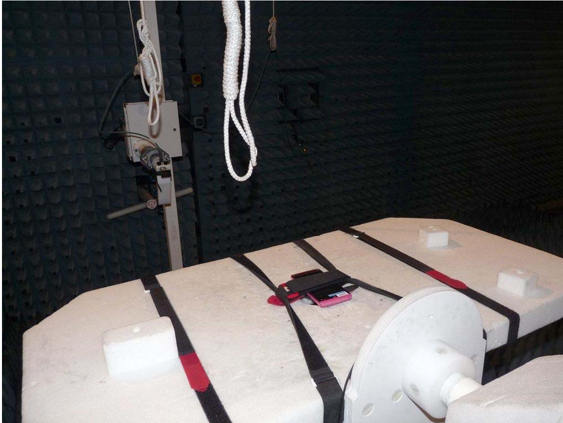
Photo 4: Test setup for radiated measurements (Enclosure, fully-anechoic chamber, 18-25 GHz, intentional radiator § 15)