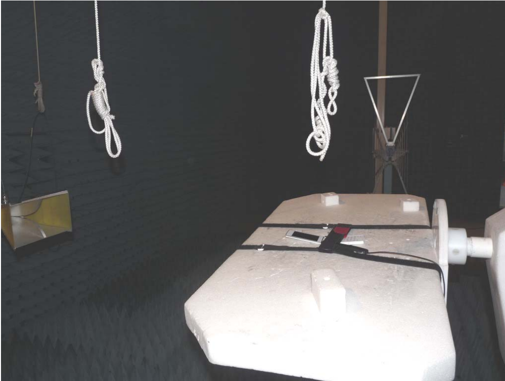
Photo 3: Test setup for radiated measurements (Enclosure, fully-anechoic chamber, 1-18 GHz intentional radiator §15 / 30 MHz – 10/20 GHz §22/24/27)