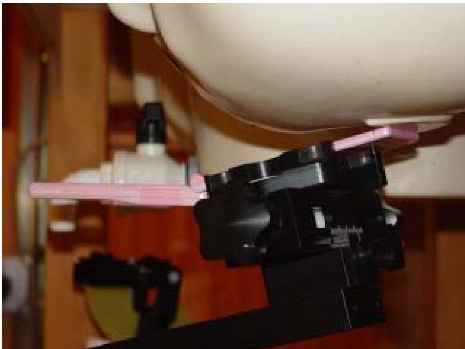
Figure 9E.2 Phone (Open) against the head (Left Tilt position)