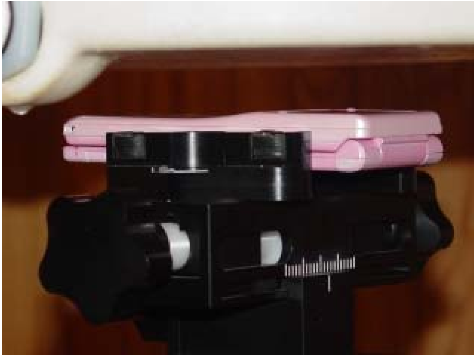
Figure 9E.3 Body SAR setup (Closed, Face Down, 15mm Air Separation)