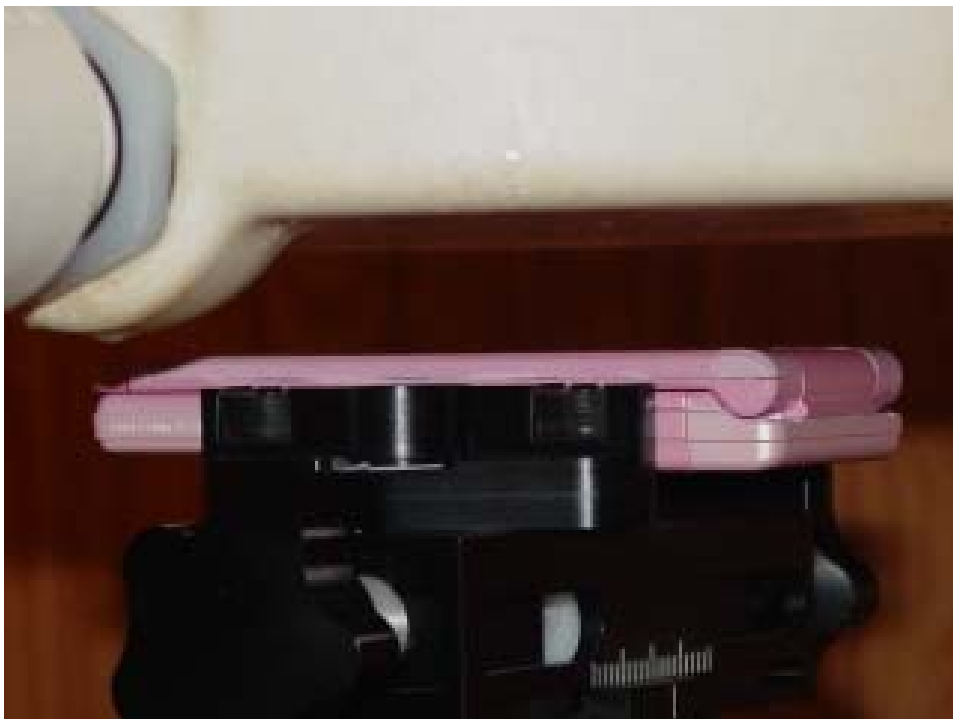
Figure 9E.4 Body SAR setup (Closed, Face Up, 15mm Air Separation)