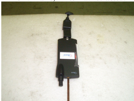
EUT: X-axis, Antenna: retracted.