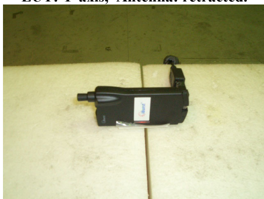
EUT: Y-axis, Antenna: retracted.