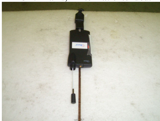
EUT: X-axis, Antenna: extended.