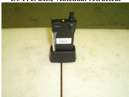
EUT: Z-axis, Antenna: retracted.