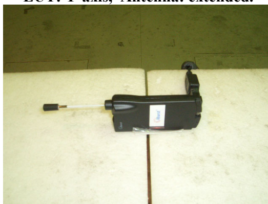
EUT: Y-axis, Antenna: extended.