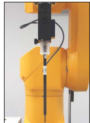
Isotropic E-Field Probe