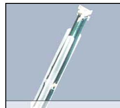
Interior of probe