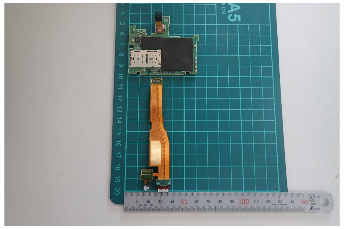
Main PCB, FPC front 2