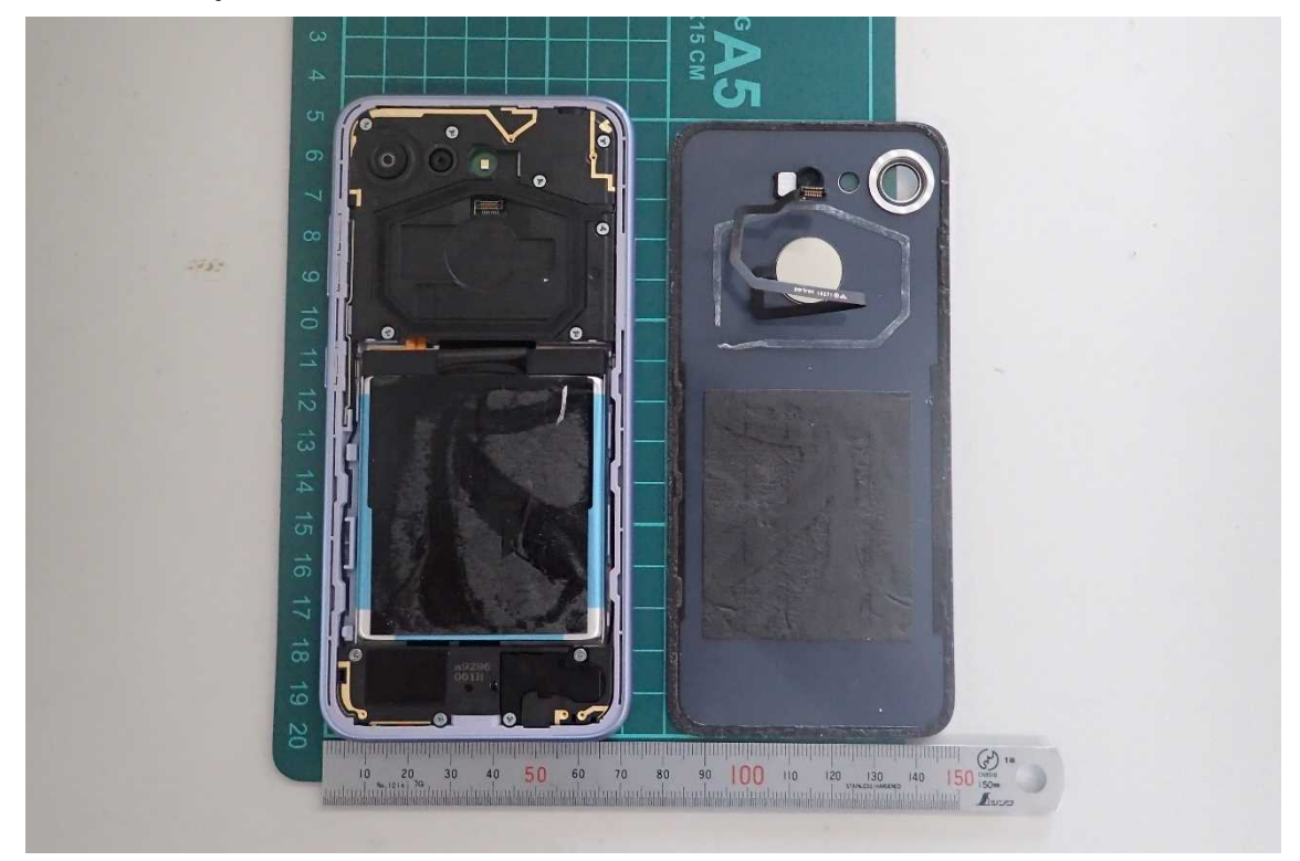
Rear cover open 2