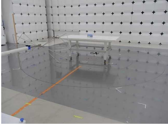
30MHz to 300MHz